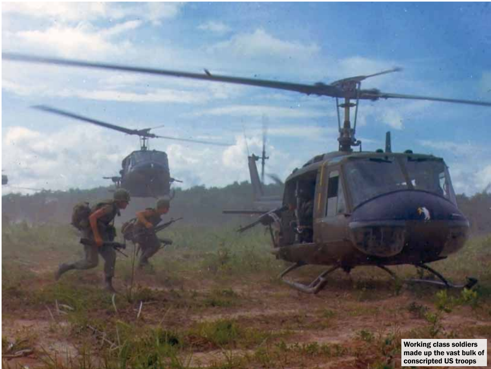
Working class soldiers made up the vast bulk of conscripted US troops

Empire Defeated: Vietnam War - the lessons for today by Peter Taaffe - £8 including postage