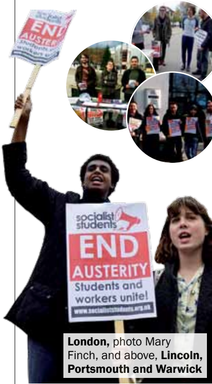
London, and above, Lincoln, Portsmouth and Warwick