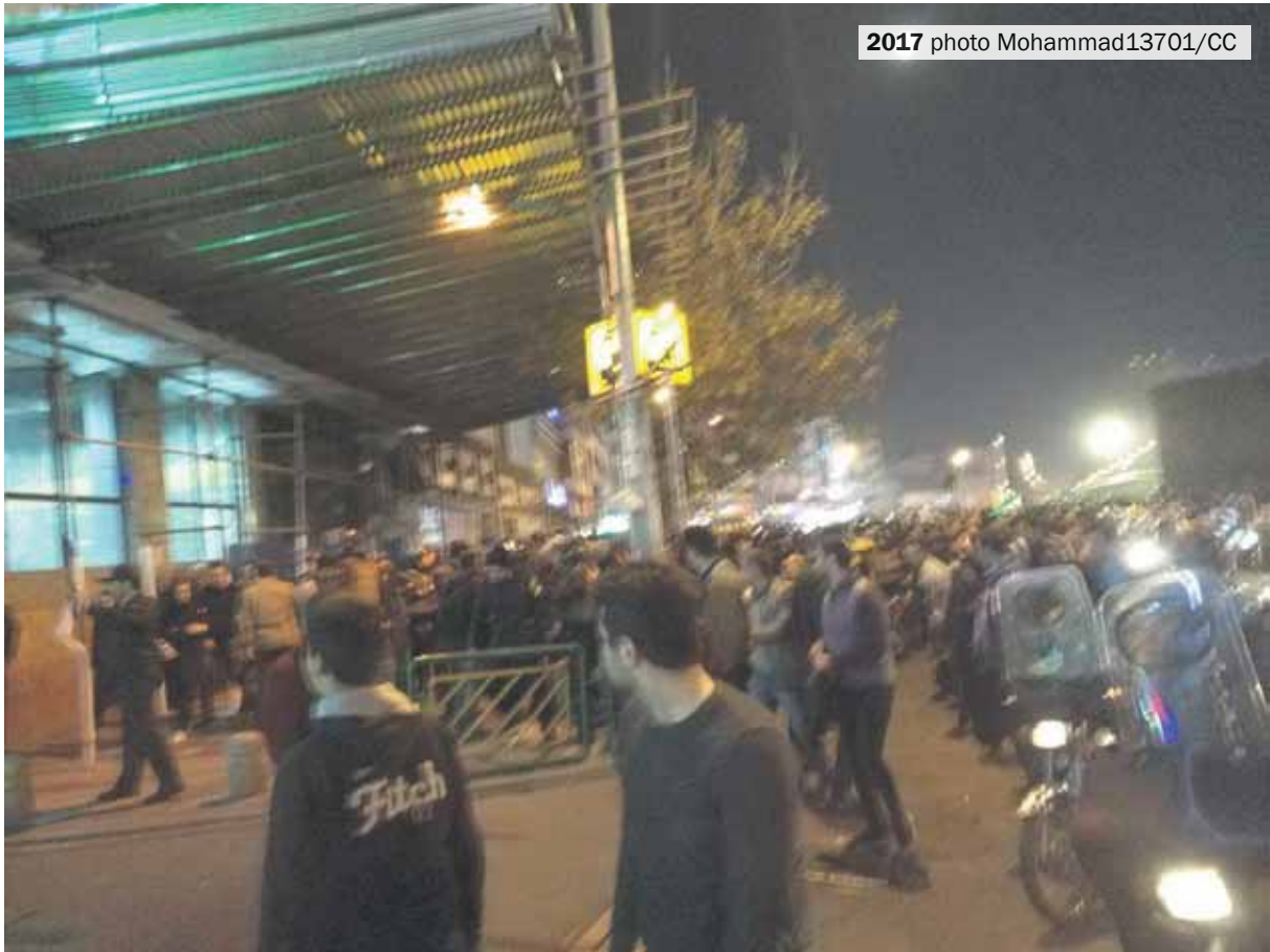
2017 photo Mohammad13701/CC

lication of the huge, increased allocation of funds to parasitic religious institutions enraged people. While this budget plan spoke of increasing state expenditure by 6%, with inflation officially running at nearly 10%, it really continued the neoliberal cuts policies which Rouhani introduced after taking office in 2013 (official figures typically downplay inflation and unemployment rates).