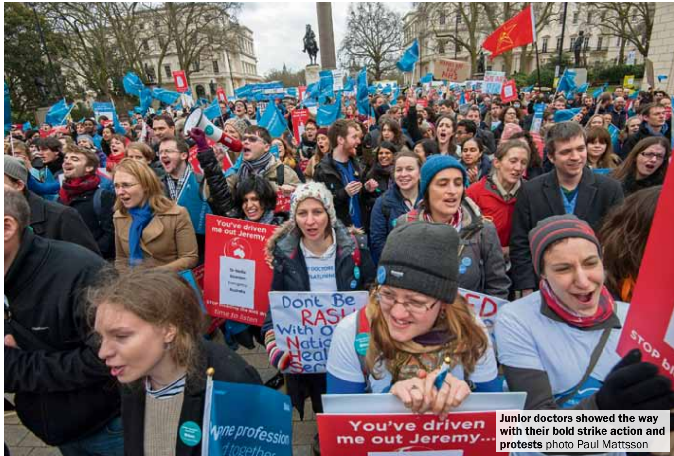
Junior doctors showed the way with their bold strike action and protests

deal with the current crisis ‘at the coal face’. And what do they get in return? A vague promise of an above-1% pay rise for the first time in six years - in exchange for considering changes to antisocial hours payments and pay increments.