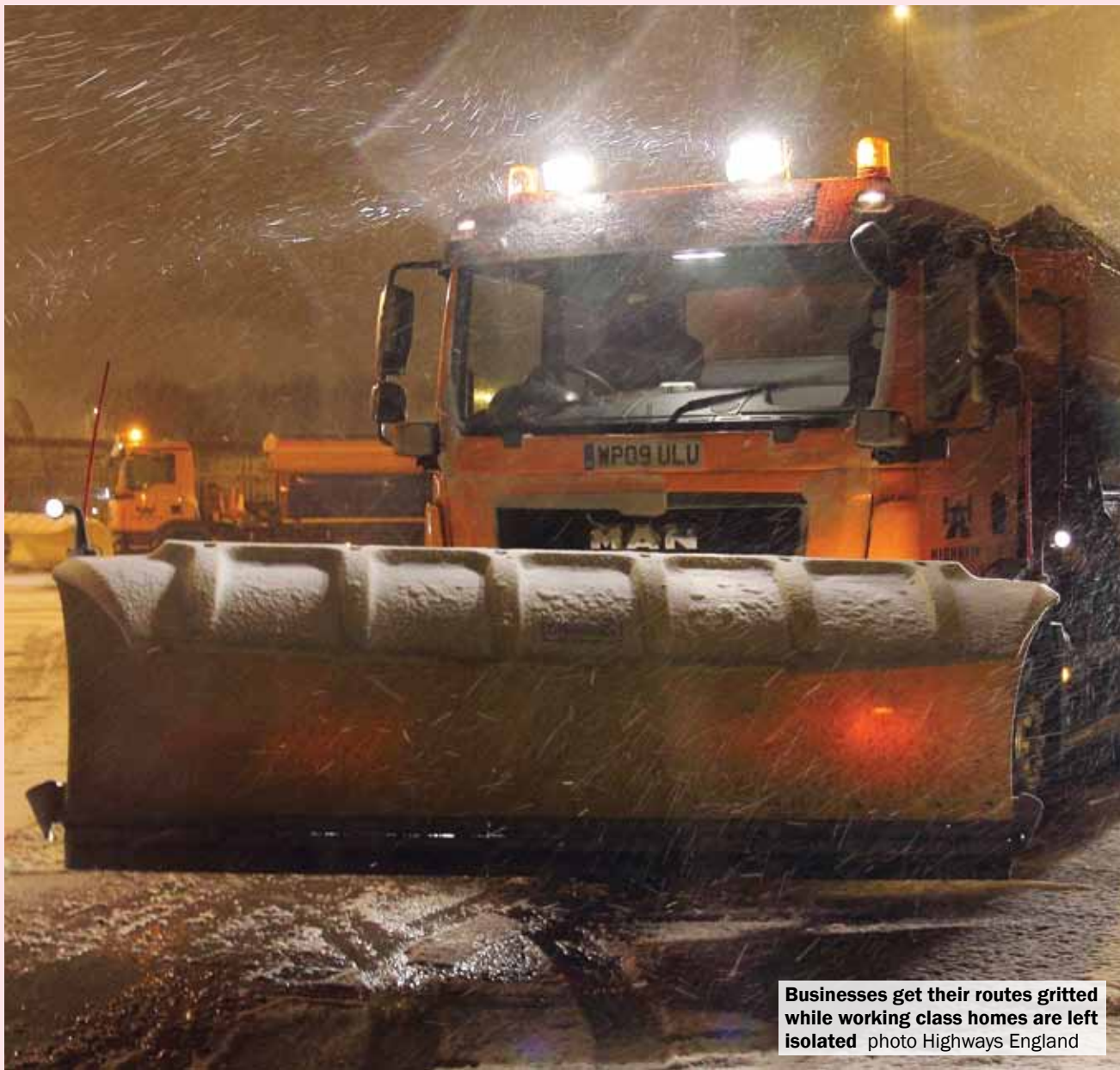
Businesses get their routes gritted while working class homes are left isolated