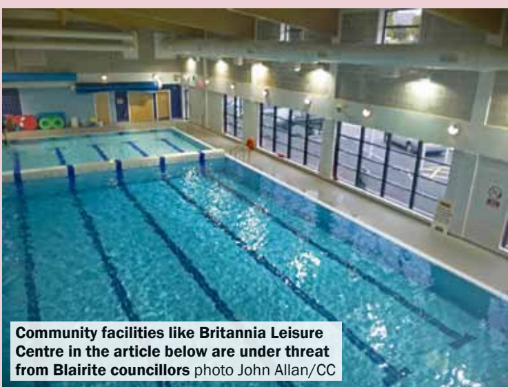
Community facilities like Britannia Leisure Centre in the article below are under threat from Blairite councillors

Should socialist anti-austerity candidates stand in May?