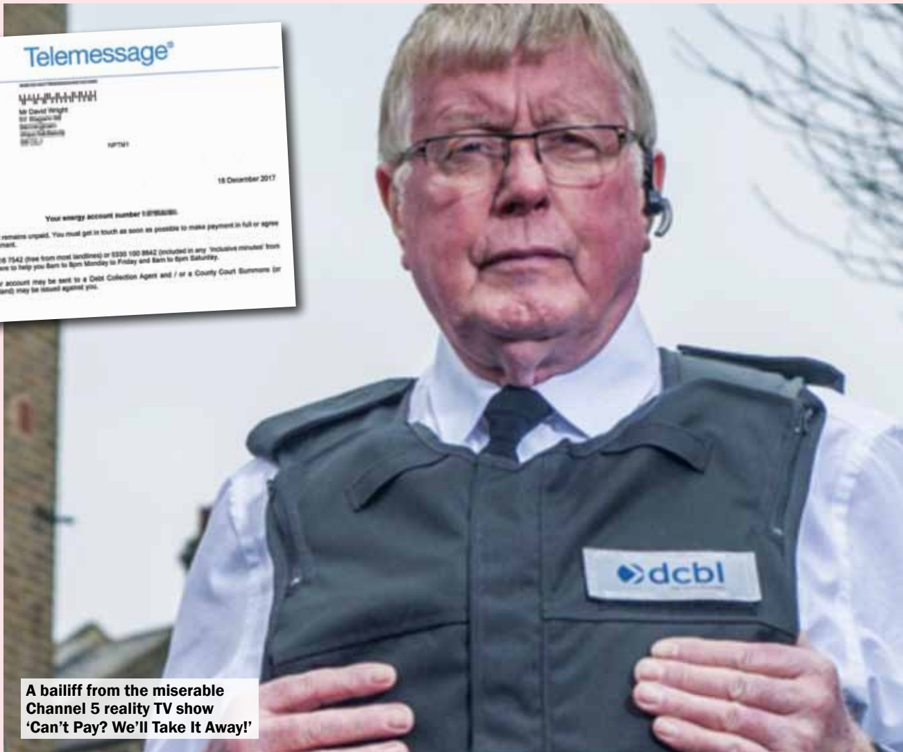
A bailiff from the miserable Channel 5 reality TV show 'Can't Pay? We'll Take It Away!'

We reserve the right to shorten and edit letters. Don't forget to give your name, address and phone number. Confidentiality will be respected if requested.