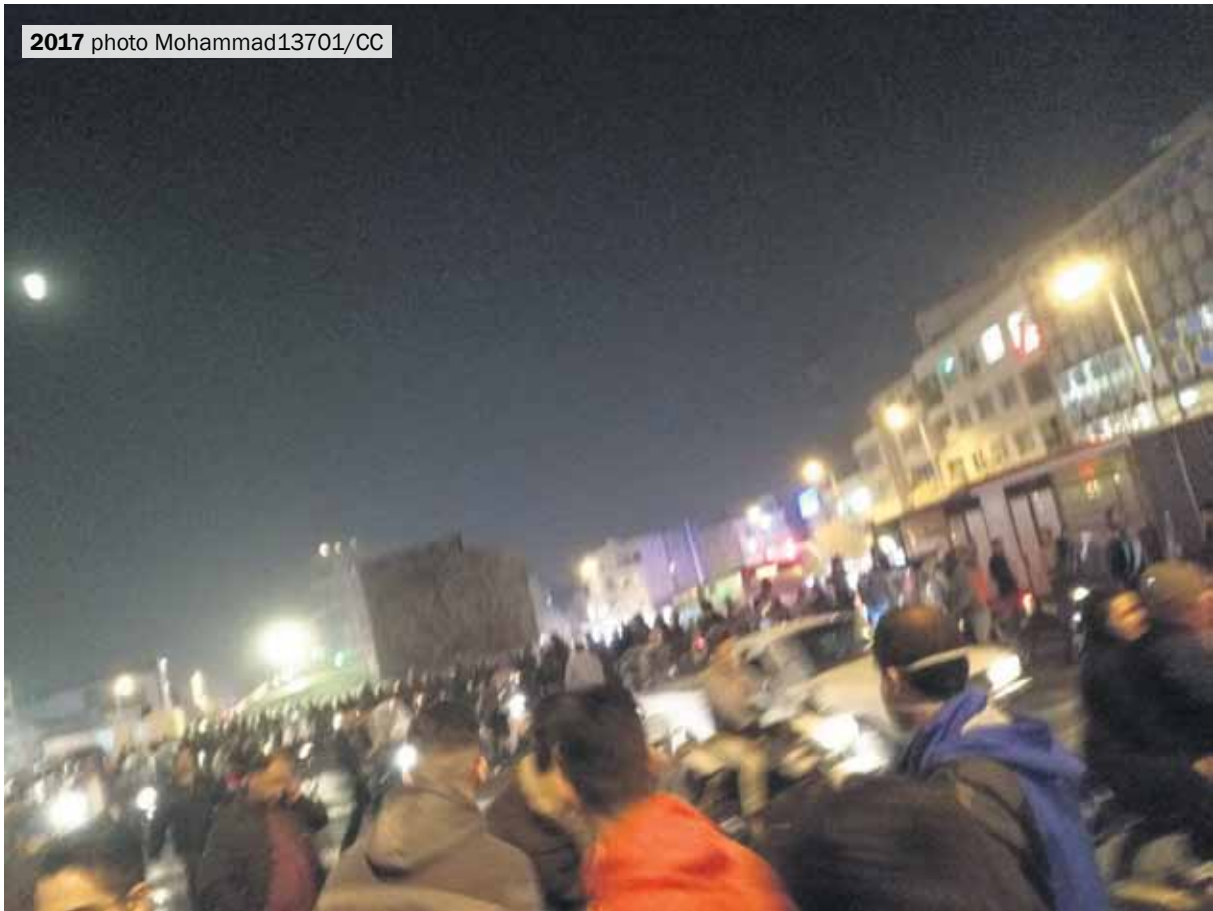
2017 photo Mohammad13701/CC

The growth of social media has completely overshadowed state-run news outlets, allowing people to share more freely their anger and dissatisfaction.