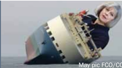
May

Reshuffle shows May's impotence Toby Young quits new uni regulator > p3