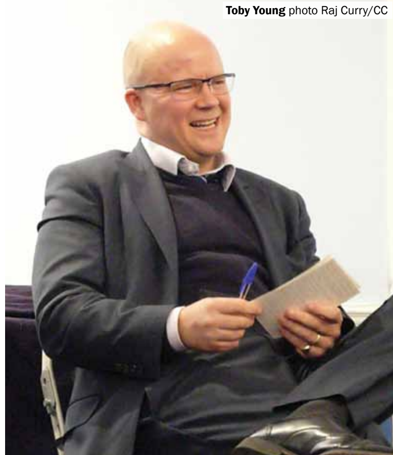
Toby Young

The trade unions should organise the killer blow for this decrepit Tory government. Mass, union-led demonstrations, coupled with coordinated strike action, could see the Tories off, rather than allowing them to stagger on in power.