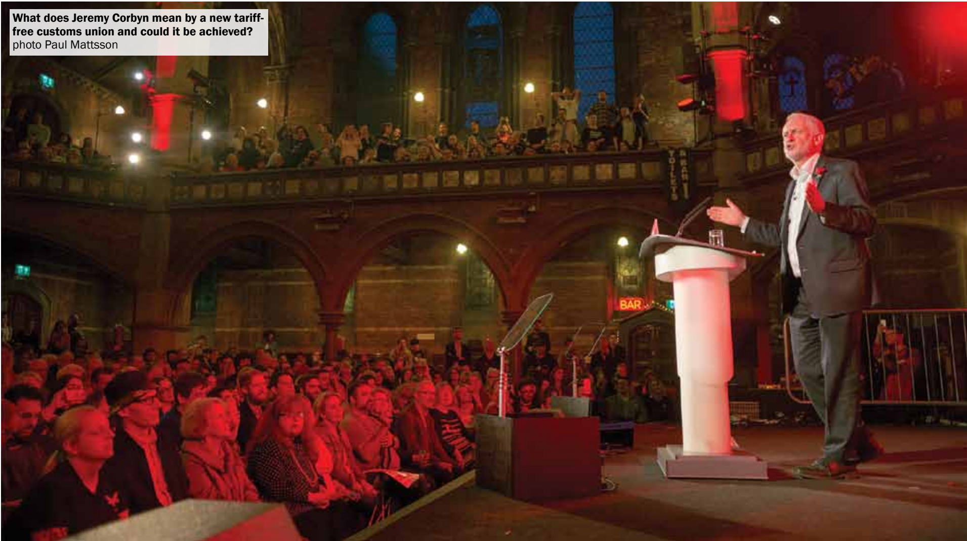
What does Jeremy Corbyn mean by a new tariff-free customs union and could it be achieved?

“” The driving force of the Single Market is to promote the interests of big business across Europe in its task of exploiting workers and competing for markets