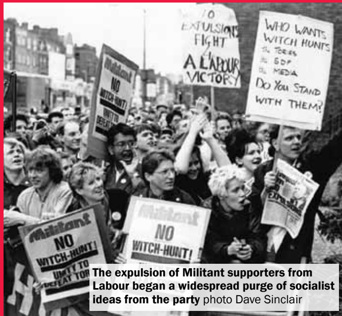
The expulsion of Militant supporters from Labour began a widespread purge of socialist ideas from the party