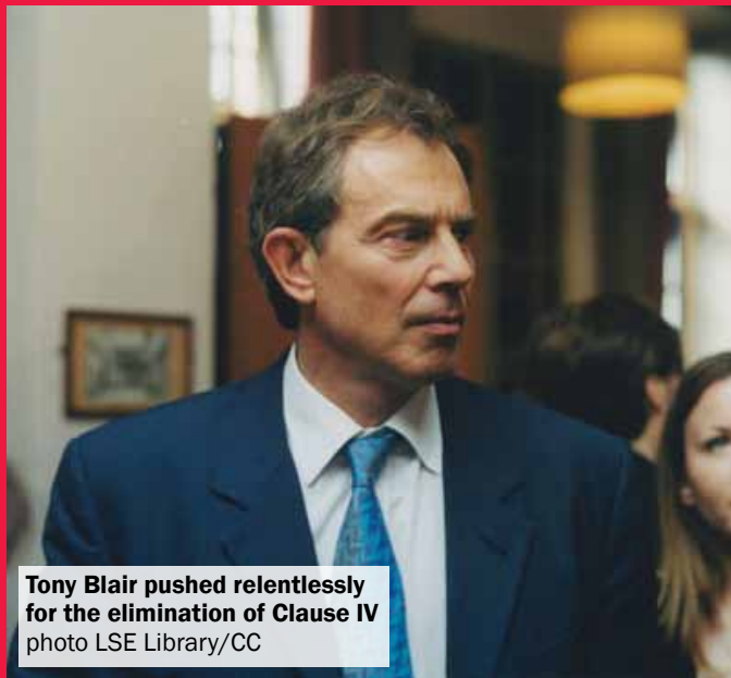
Tony Blair pushed relentlessly for the elimination of Clause IV

“We work for: a dynamic economy, serving the public interest, in which the enterprise of the market and the rigour of competition are joined with the forces of partnership and co-operation to produce the wealth the nation needs and the opportunity for all to work and prosper, with a thriving public sector and high quality services, where those undertakings essential to the common good are either owned by the public or accountable to them.”