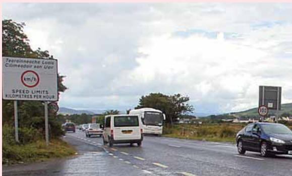
Corbyn declared that Labour “would seek to negotiate a new comprehensive UK-EU customs union to ensure that there are no tariffs with Europe and to help avoid any need for a hard border in Northern Ireland”