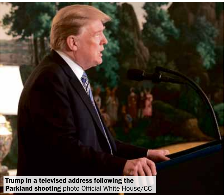
Trump in a televised address following the Parkland shooting

manufacturers and the right-wing politicians they support. The NRA is a multi-million dollar corporate lobby for an industry which, like other polluting and dangerous industries such as tobacco, asbestos, oil, coal, gas, and agrochemicals, seeks to block legislation and prevent research into measures that might protect humans and their environment from their products in order to protect their profits. One of the NRA’s standard responses to massacres like the ones in Las Vegas or at the First Baptist Church in Sutherland, is to say that the answer to “bad guys” with guns is to arm the “good guys” to the teeth. In a society where the idea of collective solidarity has been so severely undermined and where individuals feel helpless, this unfortunately has an effect. In Florida, there is now serious discussion about arming teachers in the classroom. We reject this approach which will only tend to worsen the climate of fear and violence.