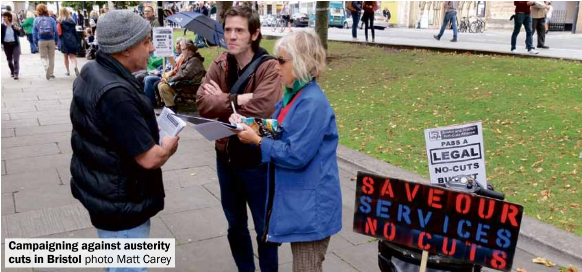
Campaigning against austerity cuts in Bristol

Bristol council has around £80 million in general reserves and over £200 million in ‘usable’ reserves, as well as the power to borrow cheaply. By using some of this money it would be entirely possible to set a