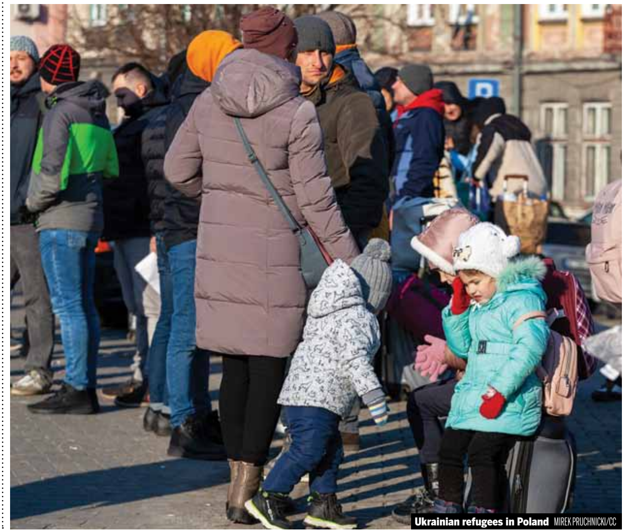
Ukrainian refugees in Poland

In 2015, for example, the shocking image of a toddler found lying face-down on a beach, one of 12 Syrians who drowned attempting to reach Greece, went viral on social media. It was the spark that led to massive demonstrations in several cities around the world. In London, tens of thousands of people marched through the street on the UN anti-racism demonstration. It was the