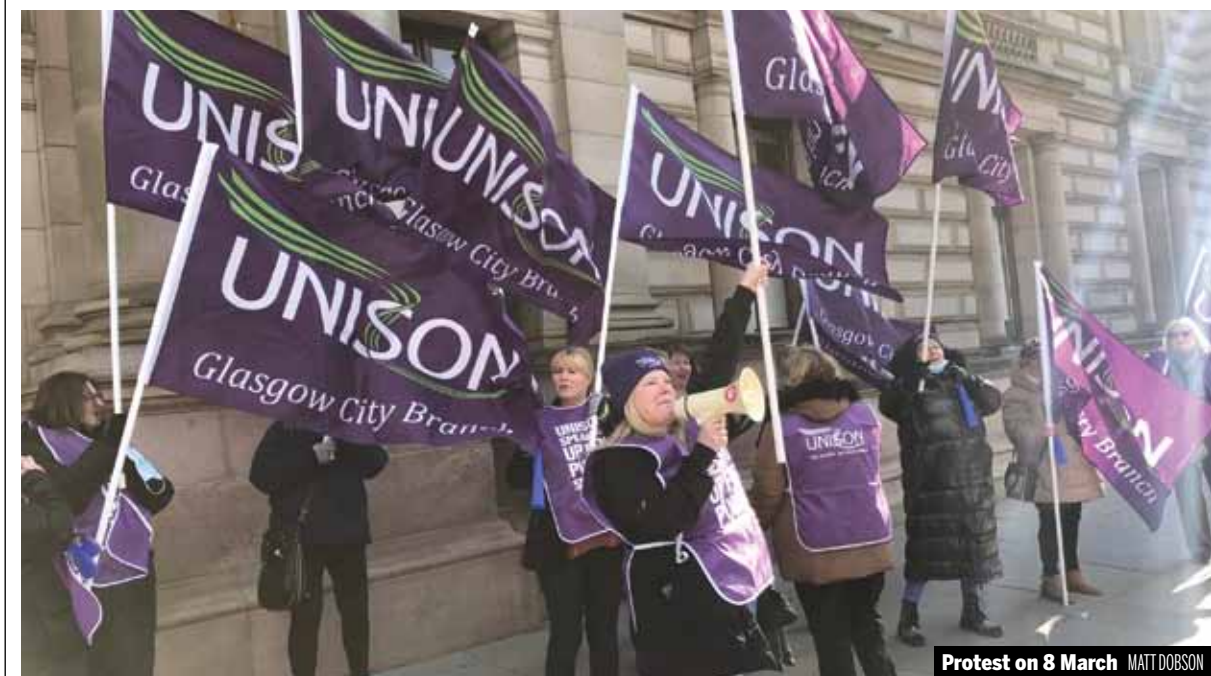
Protest on 8 March MATT DORSON

candidates across Glasgow in the forthcoming elections in support of the equal pay strike, but also for a fighting, no-cuts, needs-budget policy where the council utilises financial mechanisms to stop the cuts and funds the needs of working-class people in the city, mobilising a mass campaign to demand the funding from Holyrood and Westminster.