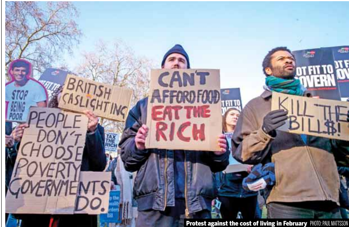
Protest against the cost of living in February

Thousands of households in Britain face financial catastrophe, and millions more face hardship. As the Socialist went to press, Chancellor Rishi Sunak was putting the finishing touches to his Spring statement.