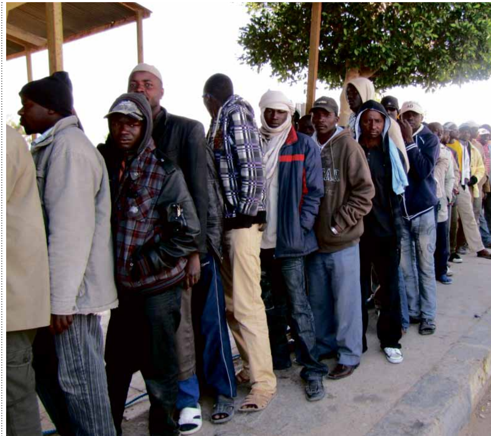
Migrant workers at the Egypt-Libya border queue for food relief

Heavy rains in China means its wheat crop might be 20% less than expected, although China's 18