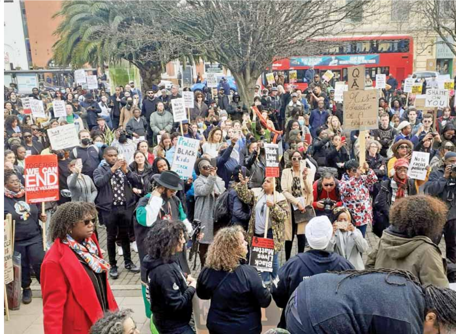
Socialist Party members joined protests at Hackney Town Hall and Stoke Newington police station LONDON SP