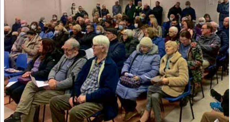
A packed SSI meeting pledges to halt a planned toxic incinerator

The public meeting unanimously agreed to stage more marches in the coming weeks.