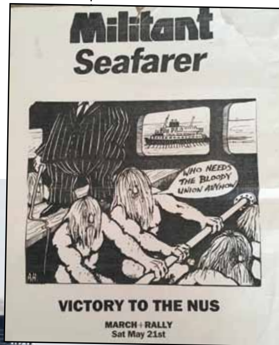
Socialist Party (then Militant) poster from the 1988 National Union of Seamen strike, below

The Trades Union Congress has finally called a national demo in June against the cost of living squeeze and the Tory and employers' pay freezes and wage cuts. But now is the moment. Whether it's in central London or at one of the ferry ports, such a mobilisation is needed and can be the platform for a victory.