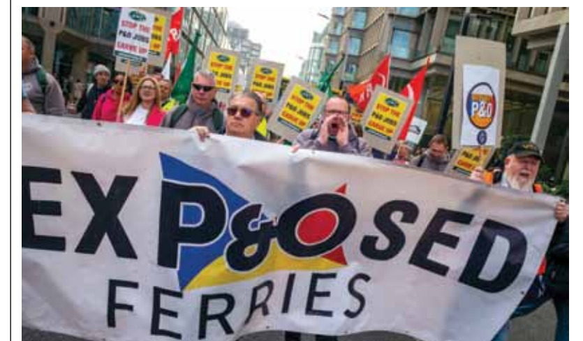
Socialist Party members joined the RMT protests in London on 18 and 21 March outside the offices of DP World and at Westminster