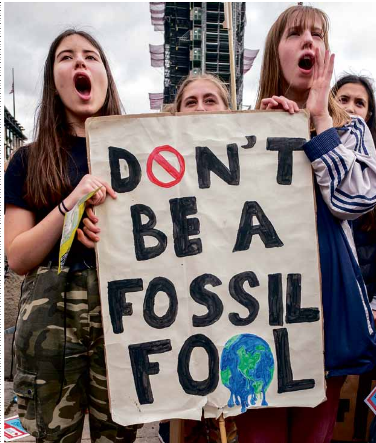
'Big oil' is making huge profits on the back of the war in Ukraine

In a capitalist society geared towards profit, rising fuel prices makes this a more attractive investment