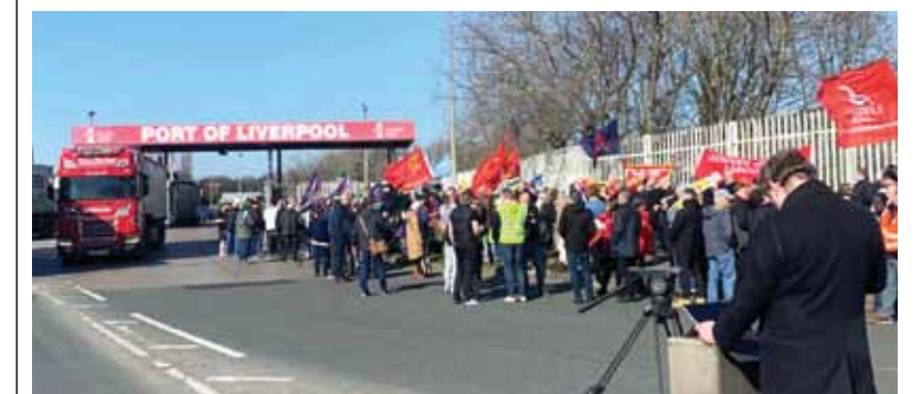
Socialist Party members joined the protest at the Port of Liverpool on 18 March