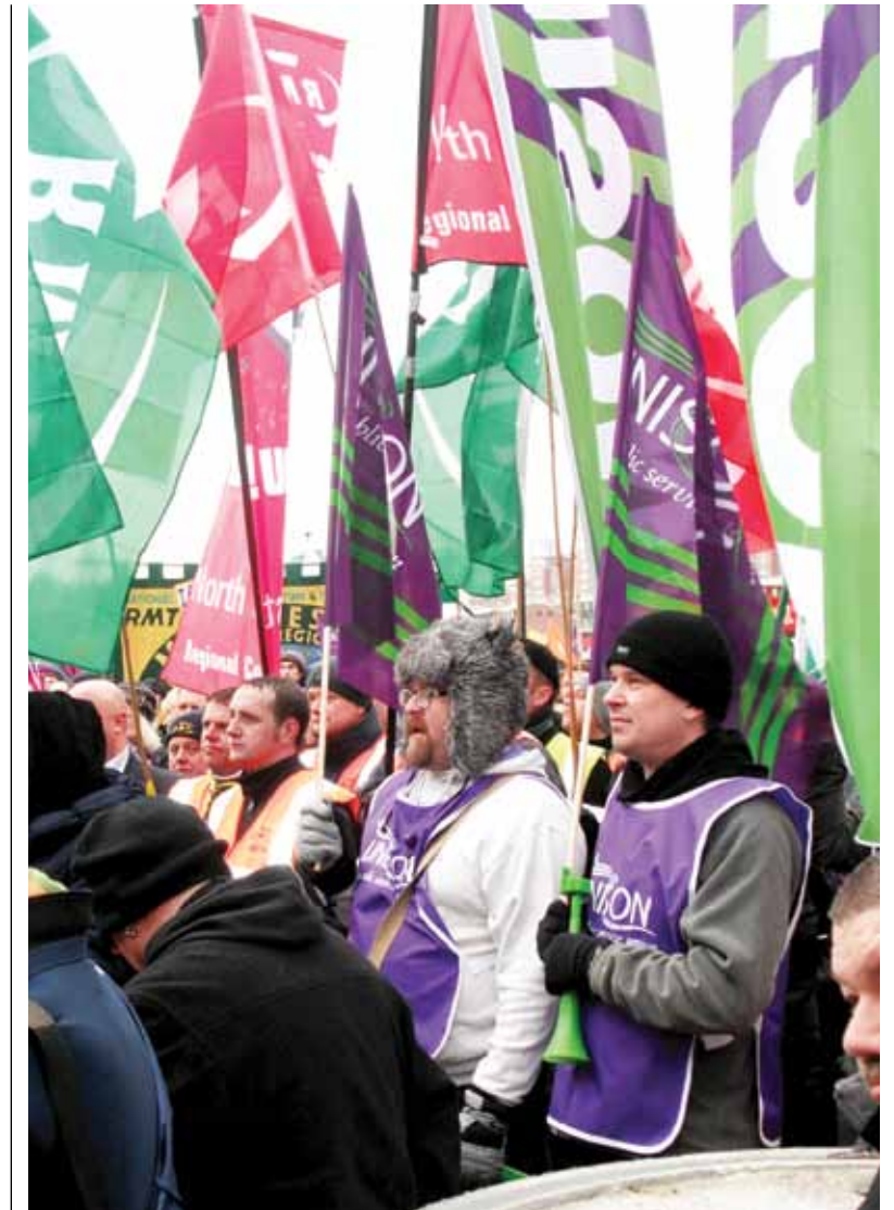
Hundreds of thousands join the public sector strike in 2011