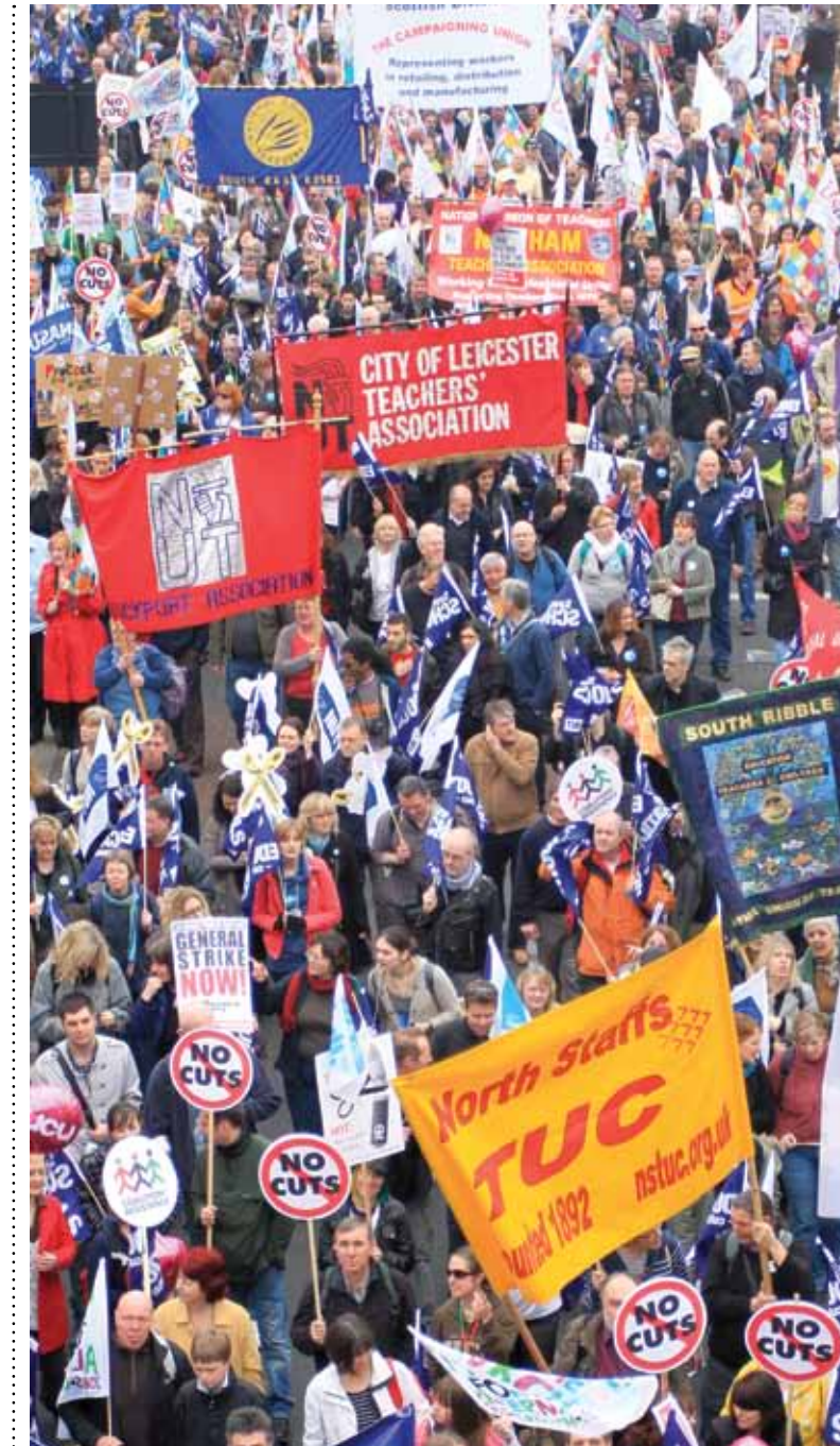
The TUC organised a mass demo in 2011 ahead of growing strikes and a public sector-wide strike in November SEMAN

If the national strikes on the railways, Royal Mail and BT were coordinated with the localised disputes, up to a quarter of a million workers could be involved