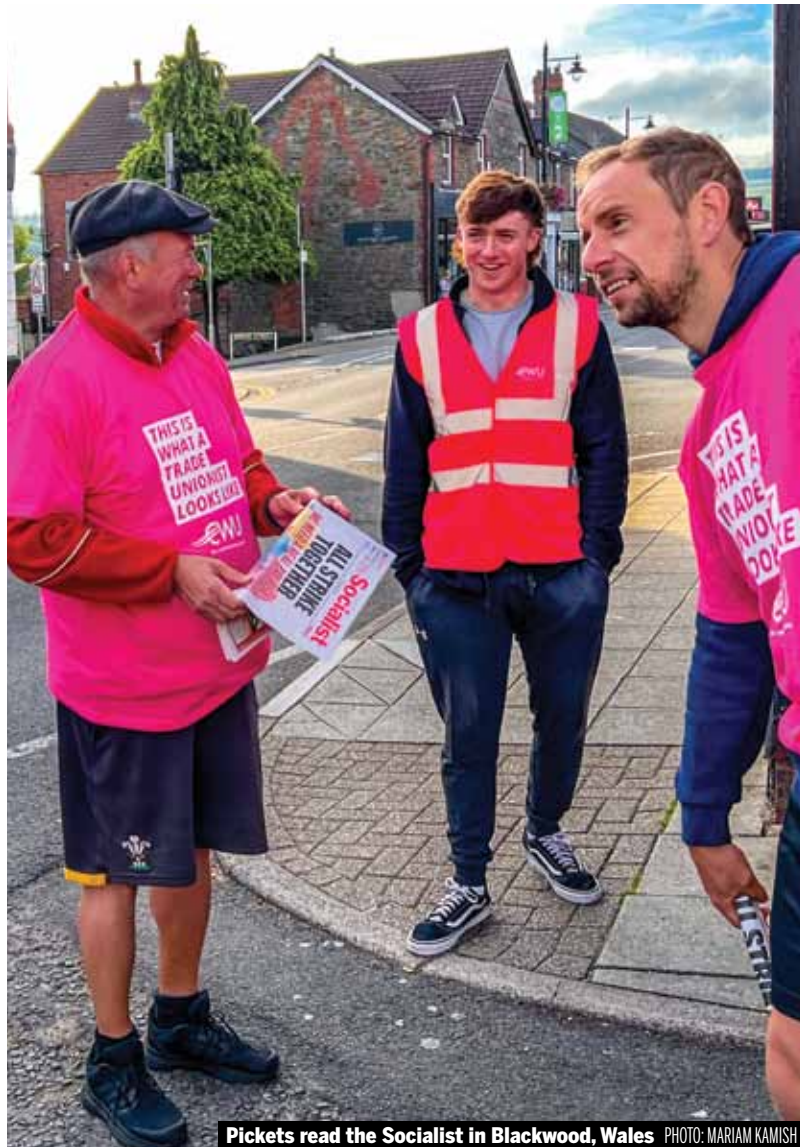
Pickets read the Socialist in Blackwood, Wales