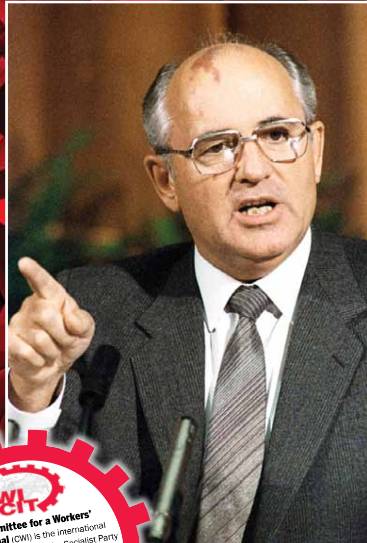
Mikhail Gorbachev

At the beginning of the 1990s the economy of the USSR was in free fall. Near-empty shops were encircled by massive queues of people holding coupons for sugar, eggs, sausage. Toilet paper was a luxury. The value of the rouble was plummeting. Young pro-capitalist economists began to push for a rapid 'transition to the market' and 'shock therapy'.