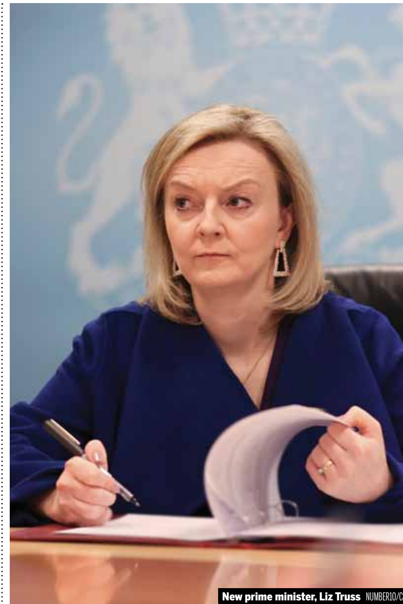
New prime minister, Liz Truss

In the midst of the Brexit crisis the likes of Michael Heseltine voted