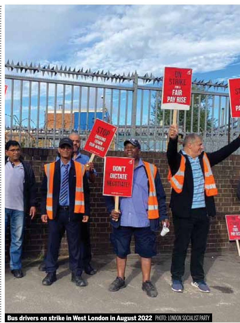
Bus drivers on strike in West London in August 2022

Insource public transport - run for need, not for profit - a responsibility to workers and communities, not shareholders.