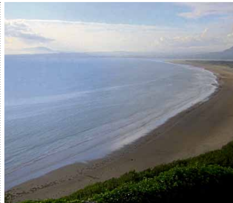
Beaches such as this one on Cardigan Bay have been polluted by untreated sewage

In the eight years it's been monitoring, it's issued only enforcement notices, no fines. In many places there's