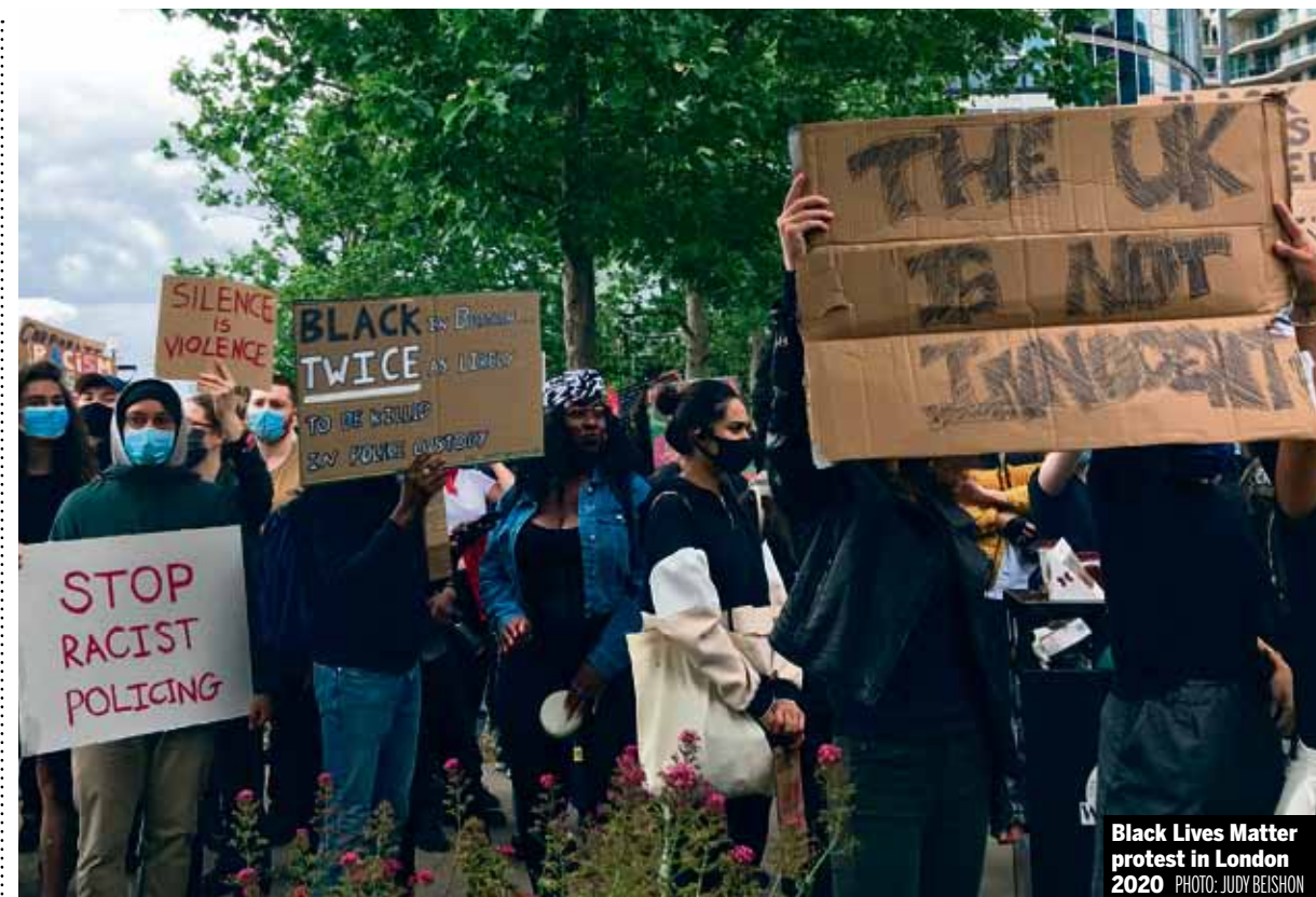
Black Lives Matter protest in London 2020

Socialists fight for immediate steps to improve conditions and stop racist discrimination. The Socialist Party demands an immediate end to stop and search, demilitarisation of the police, and for the abolition of the Territorial Support Group, Special Branch, and other similar paramilitary units. We also demand the end of police spying, which has mainly been carried out on