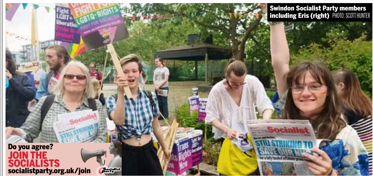
Swindon Socialist Party members including Eris (right)