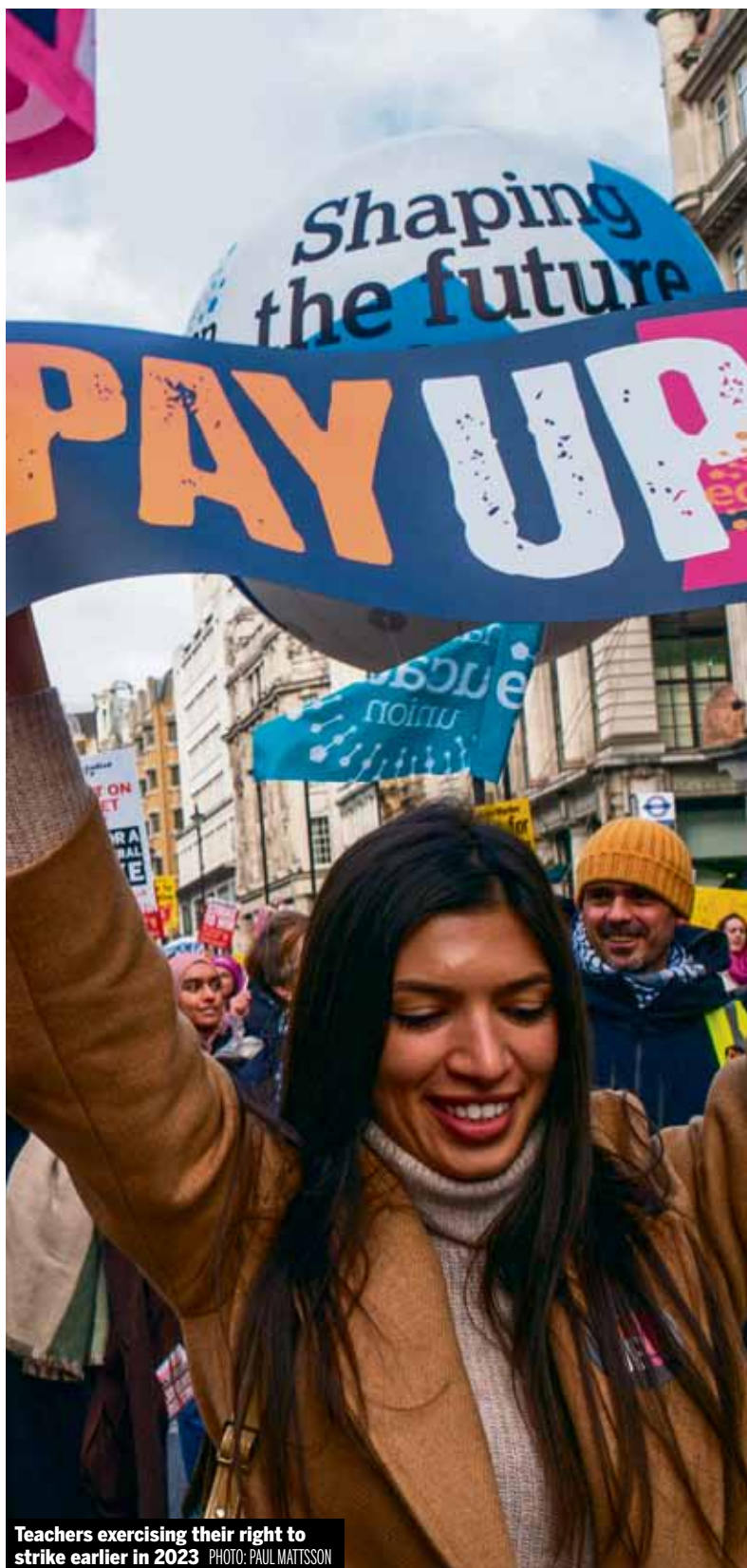
Teachers exercising their right to strike earlier in 2023