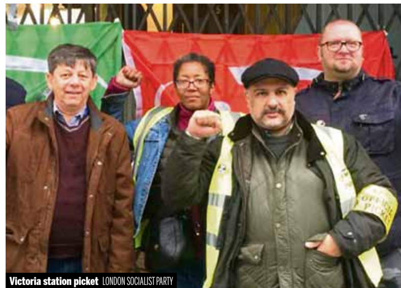
Victoria station picket LONDON SOCIALIST PARTY

However, increases to salary bands do not fully cover the additional £1,000 pay rise now being applied.