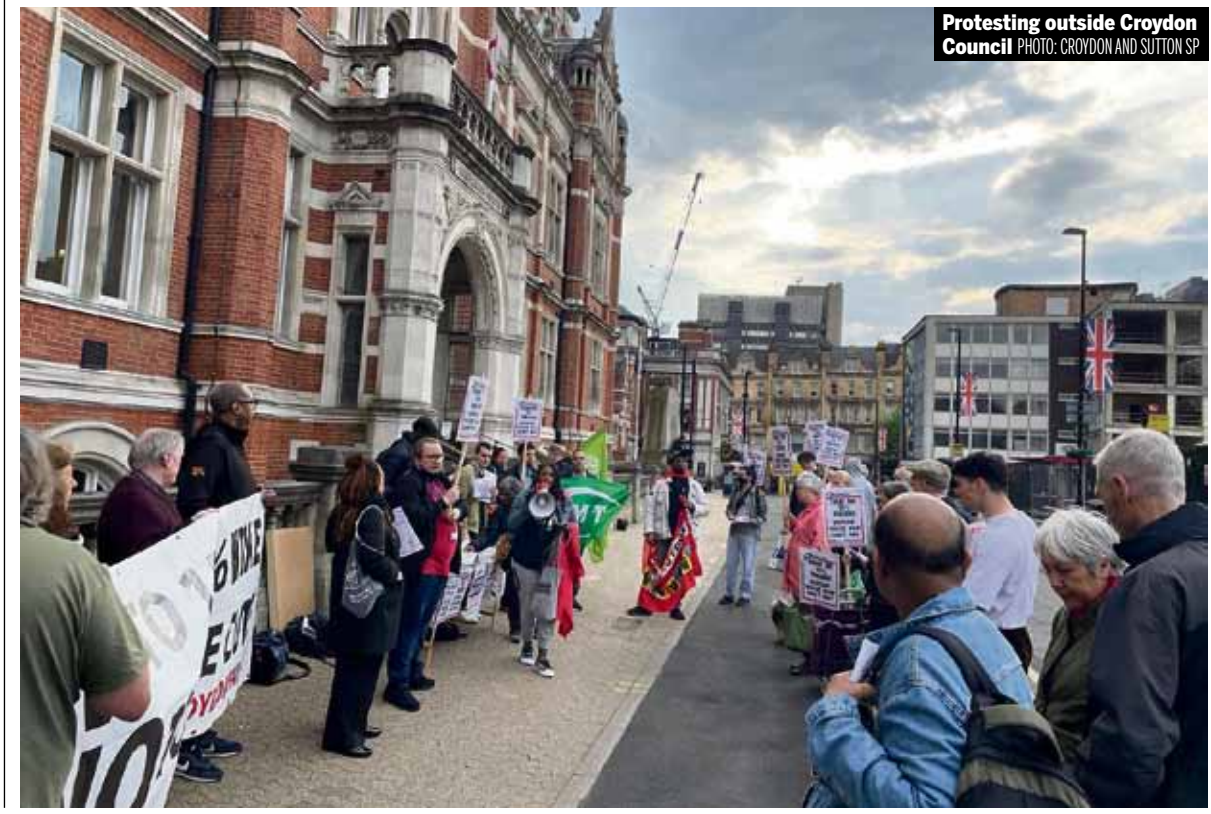
Protesting outside Croydon Council

When the council threatened to close down nurseries we got members and non-members to join the protest that eventually succeeded in stopping the closures. Croydon council was declared 'bankrupt' for the third time in two years last March, and so there will inevitably be more battles for the branch to be involved in. We will continue to do that and develop the forces of socialism. Through our branch meetings, reading group and interventions, we will continue to do all we can to develop the forces of socialism in Croydon and Sutton.