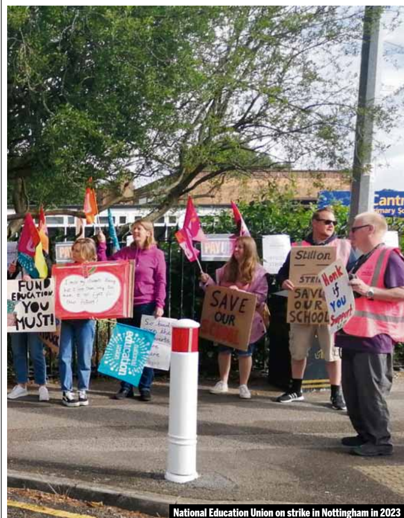
National Education Union on strike in Nottingham in 2023

TRADE UNION MEMBER AT NOTTINGHAM CITY COUNCIL, AND SUPPORTER OF NOTTINGHAM SAVE OUR SERVICES