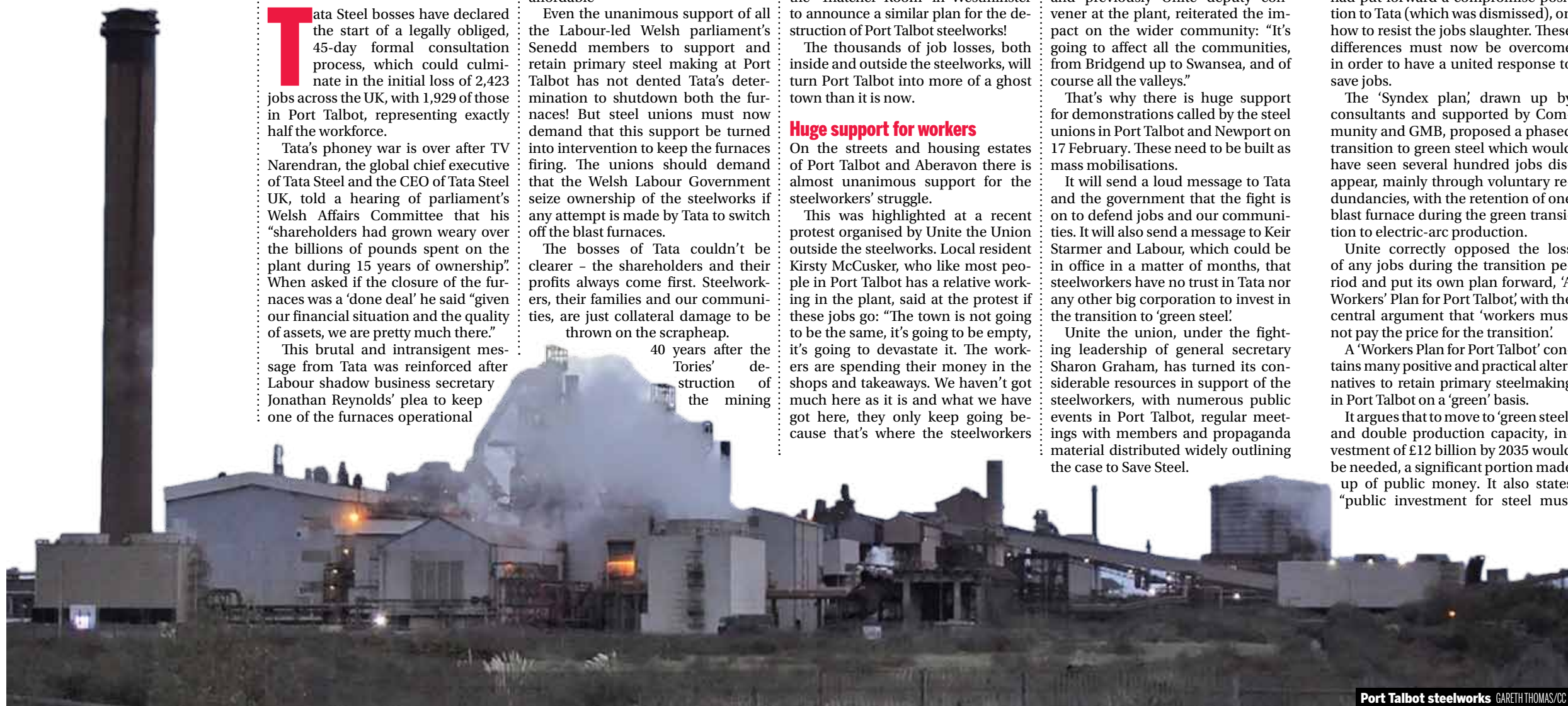
Port Talbot steelworks

● Read 'Why socialists call for nationalisation' at socialistparty.org.uk