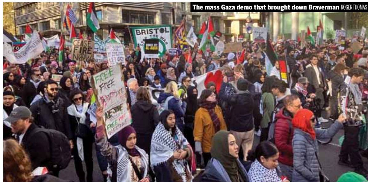
The mass Gaza demo that brought down Braverman