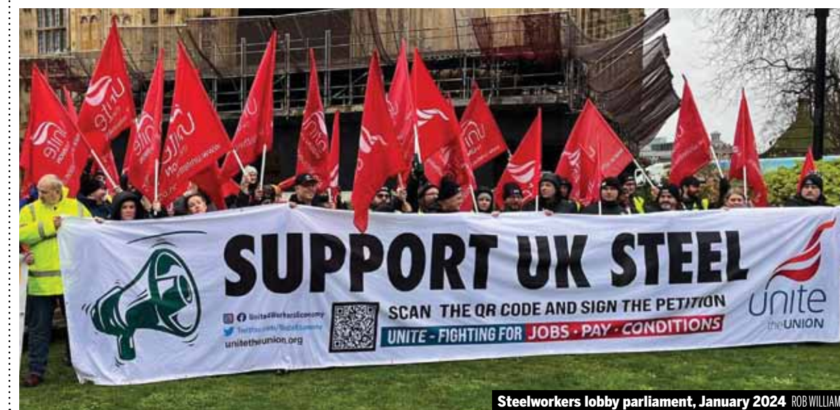
Steelworkers lobby parliament, January 2024 ROB WILLIAMS