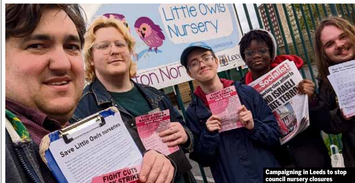
Campaigning in Leeds to stop council nursery closures

Do you agree? JOIN THE SOCIALISTS socialistparty.org.uk/join