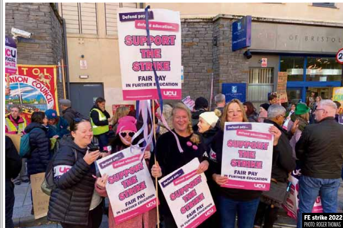
FE strike 2022