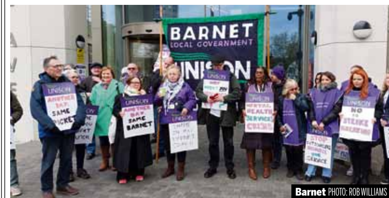
Barnet

HCAs have won an upgrade to Band 3, but management are stalling on paying all of the pay owed dating back to 2018, and have refused Unison's offer of talks at ACAS. So the strikes are on, with more planned later in the month and into May.