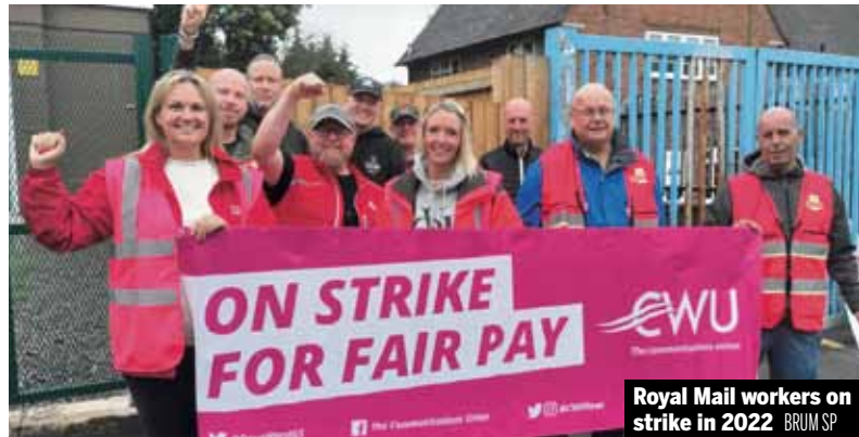
Royal Mail workers on strike in 2022 BRUM SP

But how much stronger would CWU members be if there was a mass workers' party in Parliament that represented their interests, and when motions call for Royal Mail to be renationalised, they actually fight for that!