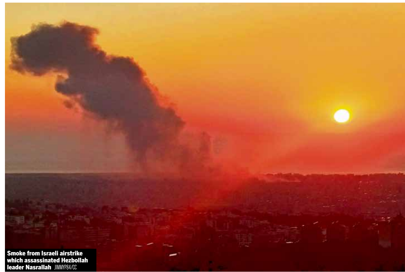
Smoke from Israeli airstrike which assassinated Hezbollah leader Nasrallah

For now, Netanyahu clearly feels boosted by the prospect of Donald Trump becoming US president – especially as Trump has selected some top officials who are close to the Israeli right; and by the damage inflicted by the IDF on Hamas,