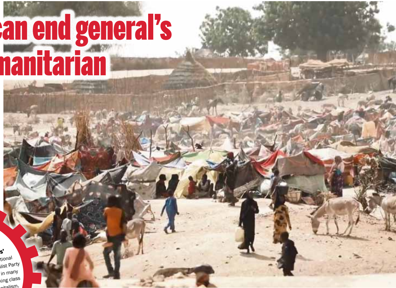
Sudanese refugee camp

This tragic situation stems from a counter-revolution against the falsely promised July 2023 elections and the mass protests led by neighbourhood resistance committees calling for full civilian rule. The 2019 revolution, which toppled the long-standing dictator Omar al-Bashir, resulted