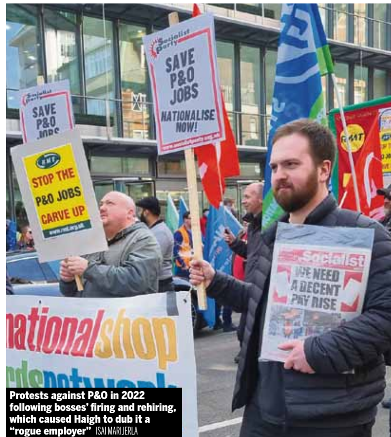
Protests against P&O in 2022 following bosses' firing and rehiring, which caused Haigh to dub it a "rogue employer" ISAI MARJERIA

Haigh might count herself lucky to not become the eighth suspended Labour MP. But loyalty to the Labour Party won't give any Labour MP the authority to do anything for the benefit of the working class outside of Starmer's increasingly tight iron grip over the party.