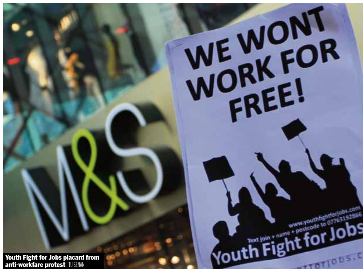
Youth Fight for Jobs placard from anti-workfare protest TU SENAN