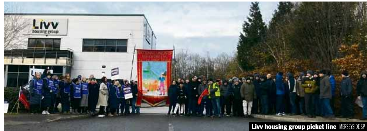
Livv housing group picket line MERSEYSIDE SP

After a friendly exchange of ideas, Ian resolved to come to future trades council meetings, a decision which was warmly welcomed and appreciated by delegates present. All the issues discussed at the trades council meeting can be raised again as the need for the trade unions to have genuine, fighting political representation is repeatedly posed in the era of Starmer's pro-big business Labour Party.