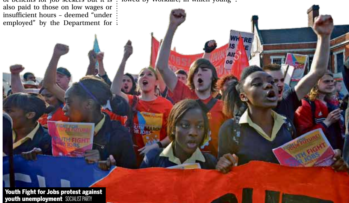
Youth Fight for Jobs protest against youth unemployment SOCIALIST PARTY

Job vacancies have fallen by 13.6% in the last year. Britain is not facing an 'epidemic of economic inactivity' but the outcome of industry's terminal decline, decades of company closures and redundancies, the drive to push down wages, increase working hours and privatise public services - all in the interest of private profit. This Labour government is acting in the interest of the bosses' system by attacking the rights and benefits gained by the working class through a century of struggle. Only public ownership, democratic working-class control of the economy and socialist planning can provide young people with decent jobs, high-quality affordable housing and a meaningful future.