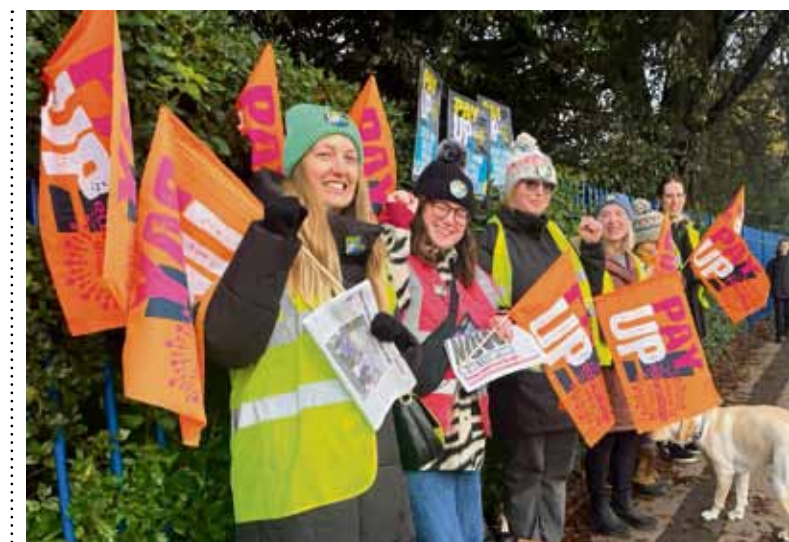
Itchen sixth form college, Southampton (above), Notre Dame sixth form college, Leeds (below), Monoux college, Waltham Forest SOCIALIST PARTY