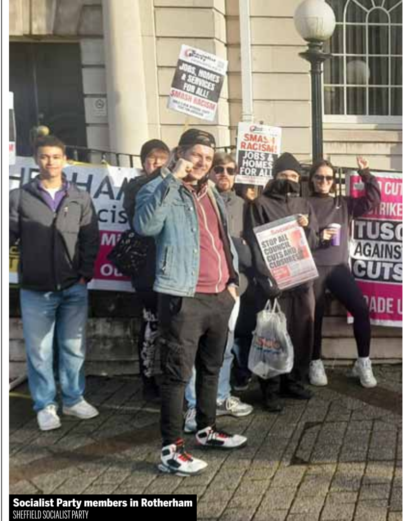
Socialist Party members in Rotherham SHEFFIELD SOCIALIST PARTY