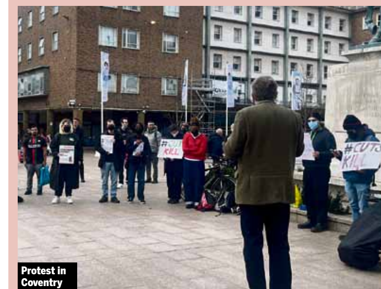
Protest in Coventry