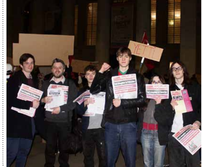
Socialist Party members on a solidarity protest in Manchester on 24 March

Such a united front of workers emerging from this struggle, armed with a political programme, could force Erdogan out and offer a socialist alternative - fighting to take the banks and other giant companies that dominate the economy, like textile and steel, into the democratic control of the working class, planning society in our interests and securing a decent future for all.