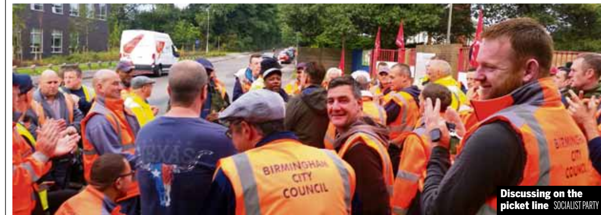
Discussing on the picket line SOCIALIST PARTY