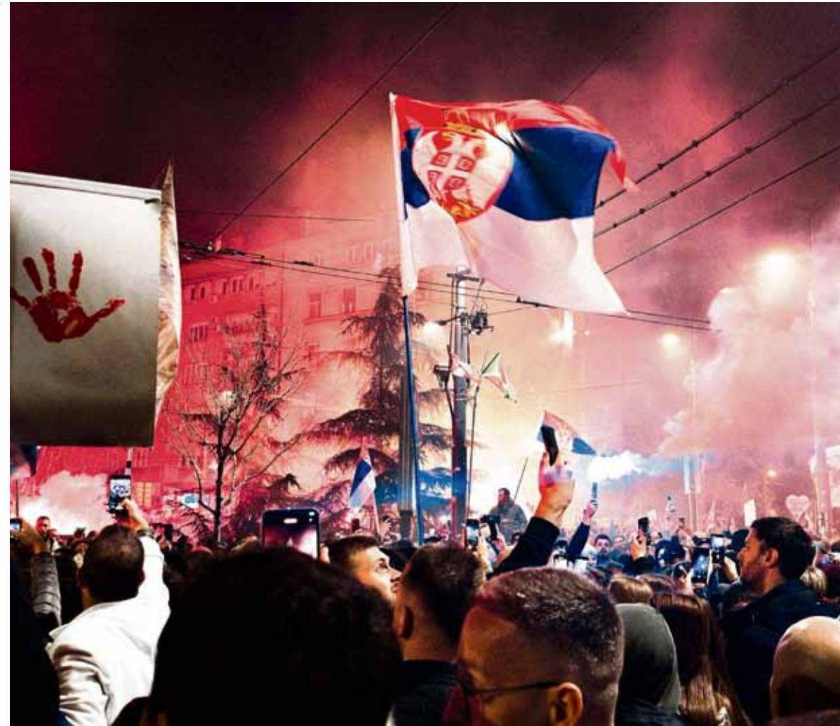
Protest in Belgrade

The protests have not stopped. Students are organising another big protest for 4 April. But it feels like