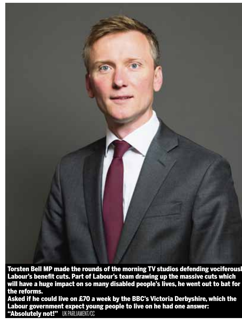
Torsten Bell MP made the rounds of the morning TV studios defending vociferously Labour's benefit cuts. Part of Labour's team drawing up the massive cuts which will have a huge impact on so many disabled people's lives, he went out to bat for the reforms. Asked if he could live on £70 a week by the BBC's Victoria Derbyshire, which the Labour government expect young people to live on he had one answer: "Absolutely not!"

Conference further instructs the National Executive Committee to call for the TUC Disabled Workers' Committee to organise a demonstration and lobby of Parliament in support of these demands, and for the TUC to organise a weekend demonstration against Labour austerity as a launchpad for sustained trade union action in defence of workers and young people.