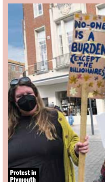
Protest in Plymouth