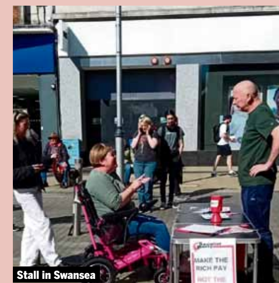
Stall in Swansea