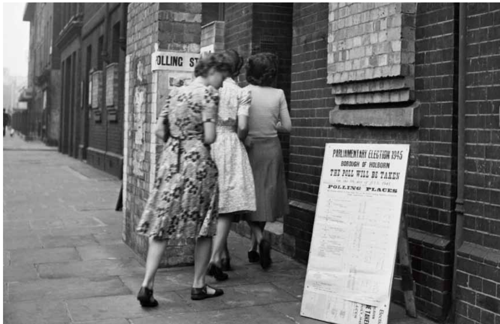
Voters arriving at a polling station in Holborn, London