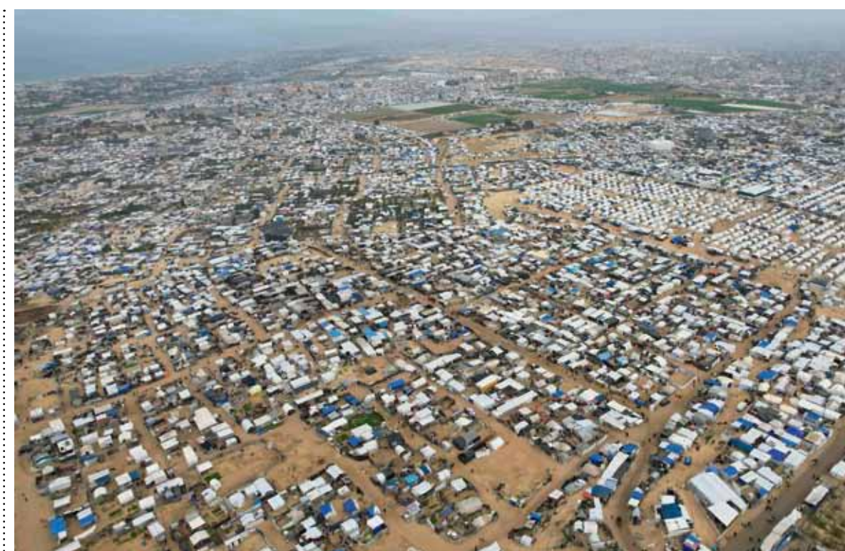
Al-Mawasi refugee camp in Rafah, Gaza

The project, which is estimated to cost $4 billion, would initially see 600,000 Palestinians forcibly relocated to the heavily guarded camp in the south of the enclave, where they would not be permitted to leave. Northern Gaza is seen as prime real estate by the Israeli ruling class and Israeli forces have been clearing areas for development and settlement by Israelis since the start of the war. Israel's military forces have clashed with the government over the plans, highlighting that current resources would be spread too thin and reflecting the disquiet of army reservists, who have previously raised concerns they were being ordered to commit war crimes in Palestine.