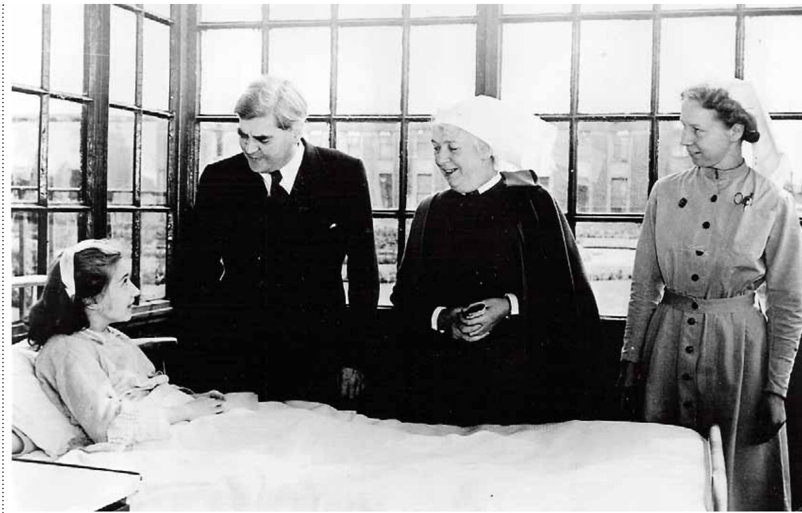
Nye Bevan, Minister of Health, on the first day of the National Health Service, 5 July 1948 at Park Hospital, Davyhulme, near Manchester

With capitalism offering no way forward, major class battles are inevitable in Britain and internationally. Independent working-class organisations will be vital in cohering these struggles, and the process of developing such organisations will sharply pose questions on what is needed to take things forward. Socialists have an indispensable role to play in pointing the way forward to the necessity of the socialist transformation of society.