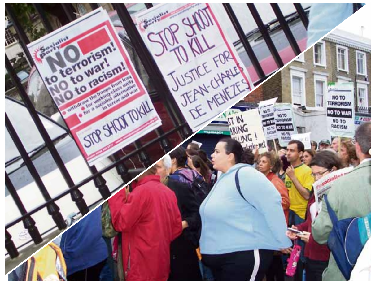
The Socialist Party marching for justice and against war in 2005