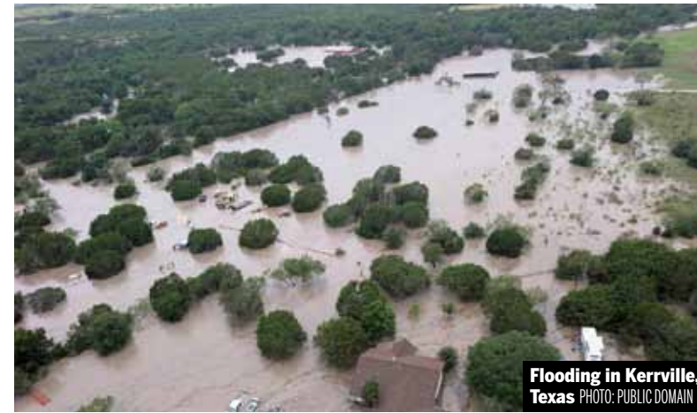
Flooding in Kerrville, Texas

JASPER CHAPLIN WEST LONDON SOCIALIST PARTY