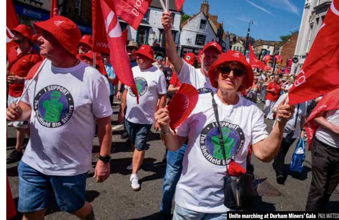
Unite marching at Durham Miners' Gala

competition for the kids. The council has had a windfall. We demand they spend money to keep our local libraries open.