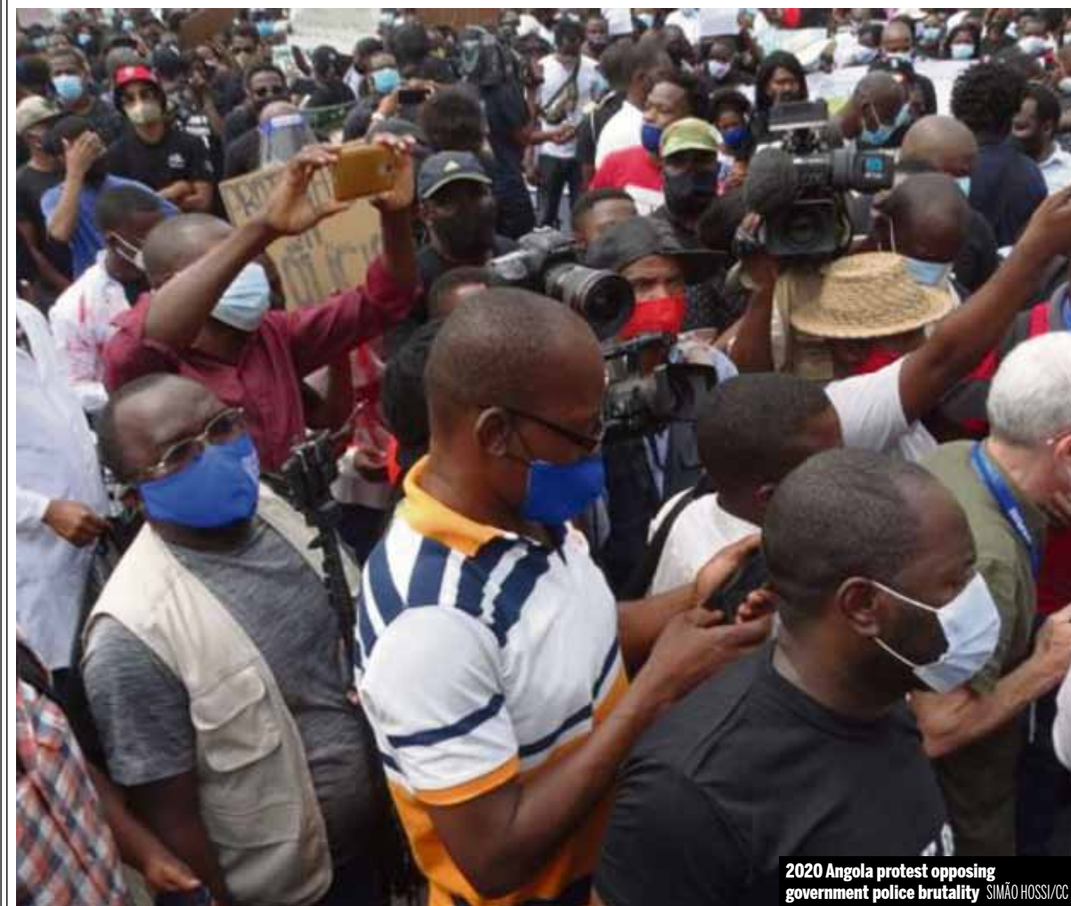
2020 Angola protest opposing government police brutality