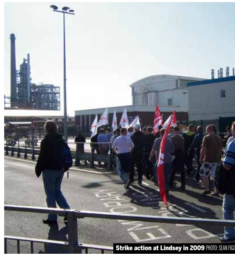
Strike action at Lindsey in 2009

Now Reform UK politicians are presenting themselves as fighting to save jobs, at the same time as Reform-led councils are themselves carrying out brutal cuts on our public services (see page 13). Unite should be demanding nationalisation to save jobs, and be taking steps to establishing a working-class political force to fight for it. There can be no truck with capitalist politicians like those of the Tories, Reform or Starmer's Labour, who offer no solutions to the jobs threat at Lindsey.