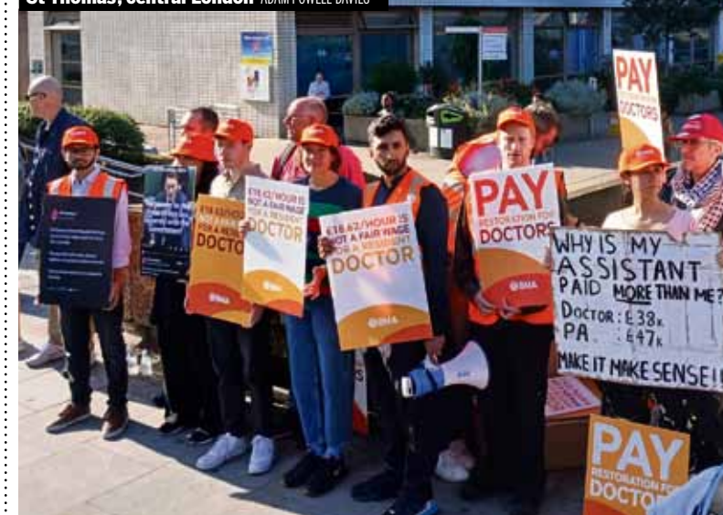
St Thomas', central London