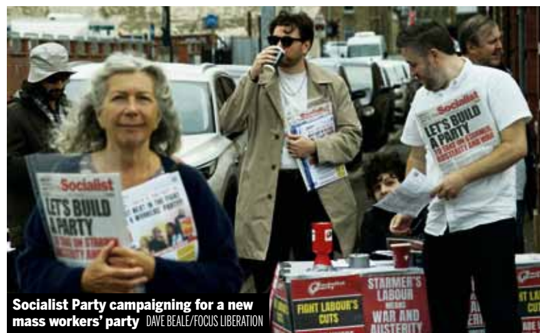
Socialist Party campaigning for a new mass workers' party.