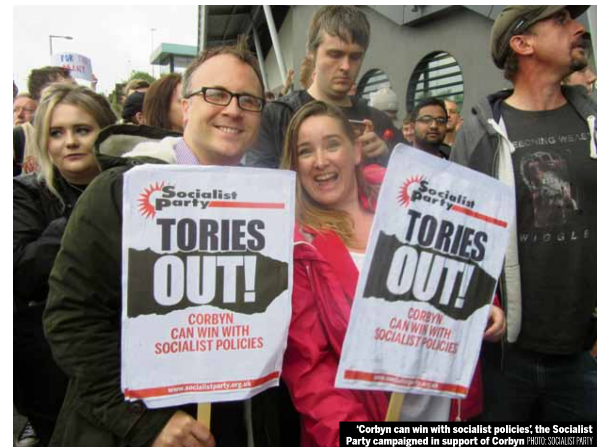
'Corbyn can win with socialist policies': the Socialist Party campaigned in support of Corbyn

On 26 August, over 700,000 people got an email asking "What should your party be called?" The first email to the huge mailing list made up of those who responded to Jeremy Corbyn and Zarah Sultana's call for "a new kind of political party. One that belongs to you".