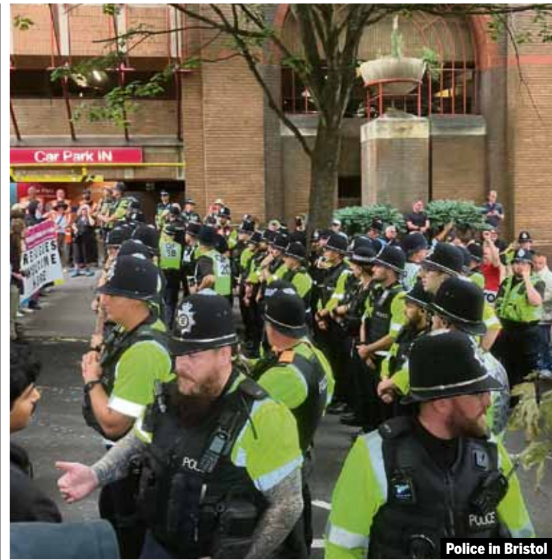
Police in Bristol