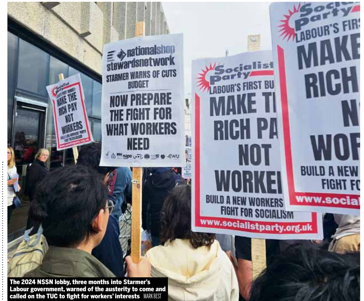
The 2024 NSSN lobby, three months into Starmer's Labour government, warned of the austerity to come and called on the TUC to fight for workers' interests. MARK BEST

The POA and BFAWU unions have powerful motions exposing the duplicity of Starmer's promises. The POA motion 17 calls for support from Congress in its fight for union rights as disgracefully "since a Labour government have been in power they have informed the POA that they do not intend to restore the right to strike for prison officers in England/Wales or Northern Ireland and they