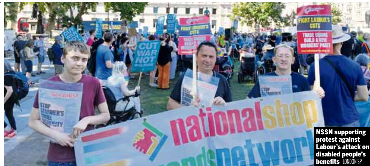
NSSN supporting protest against Labour's attack on disabled people's benefits LONDON SP

Any review of welfare reform must also involve trade unions - democratic organisations representing 1.4 million disabled workers as well as representing the workers responsible for the day-to-day delivery of services that disabled people rely on.