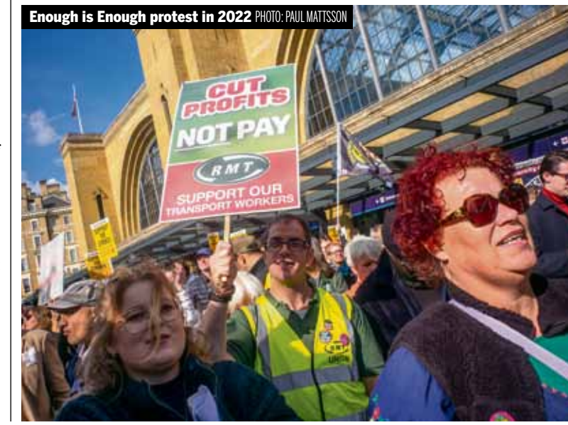
Enough is Enough protest in 2022

A founding conference made up of trade union delegates, alongside other democratic organisations, could set the framework for what would quickly become the biggest working-class party in Europe, inspiring not just people here but internationally to organise against the establishment politicians and the rigged capitalist system.