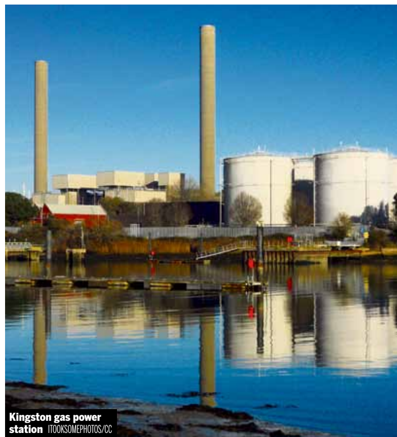
Kingston gas power station

Help fund the fightback DONATE socialistparty.org.uk/donate