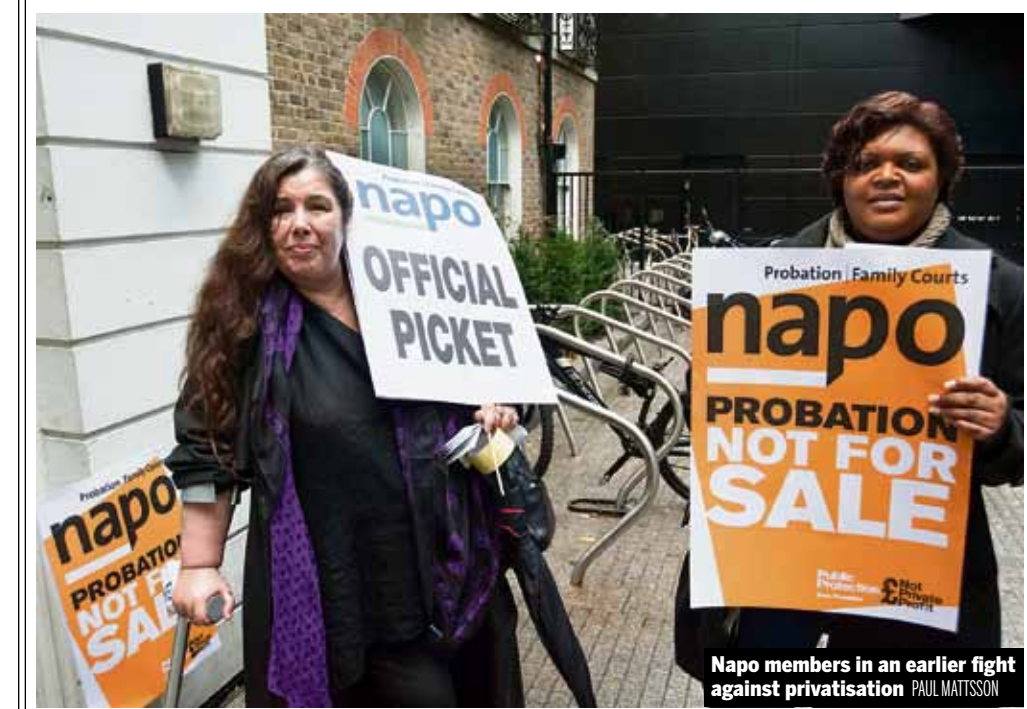
Napo members in an earlier fight against privatisation

In the NEC elections, we can vote for candidates who are serious about building a democratic, fighting union