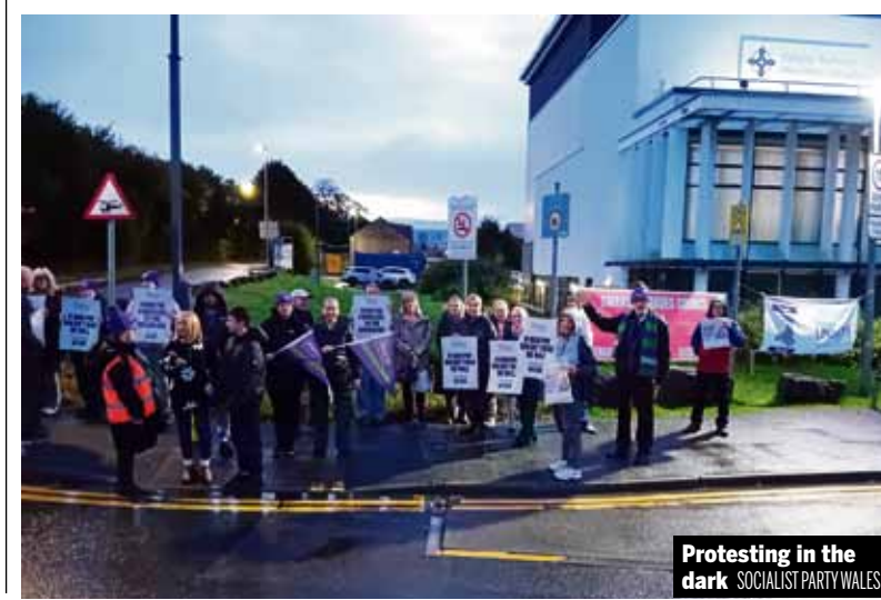
Protesting in the dark SOCIALIST PARTY WALES

This is another example of 'social partnership' being a sham. The employers and the government talk of partnership with the unions while continuing to treat low-paid employees with disdain.