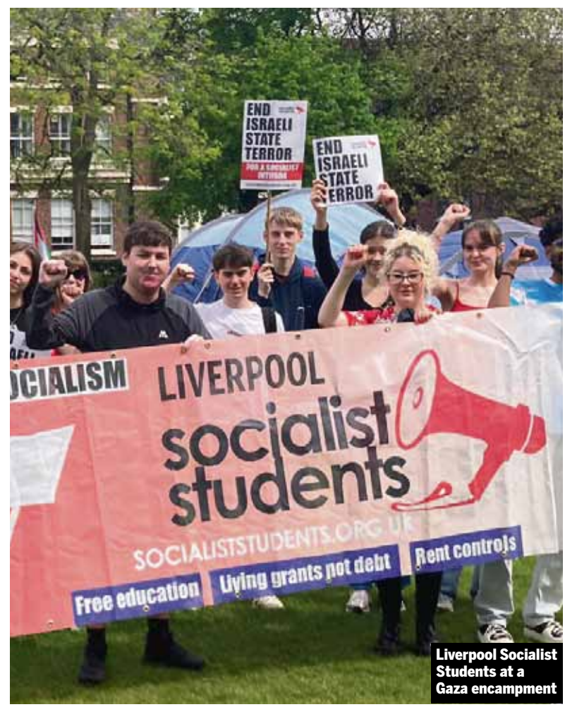
Liverpool Socialist Students at a Gaza encampment