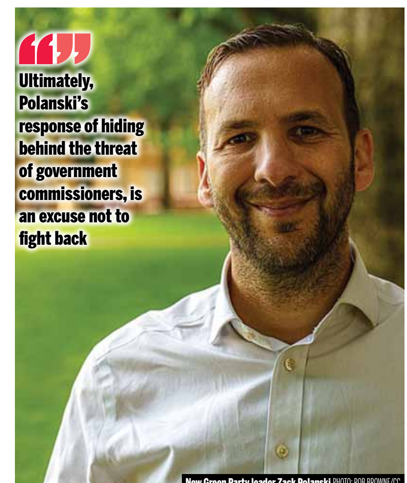
New Green Party leader Zack Polanski

Socialist Students members prepared for the meeting by drawing up a model question that we shared among those of us in attendance to increase the chances of it being asked. This ended up being the correct tactic as, of the six questions asked, only three were taken from the floor. The other three were prepared questions from the chair of the meeting.