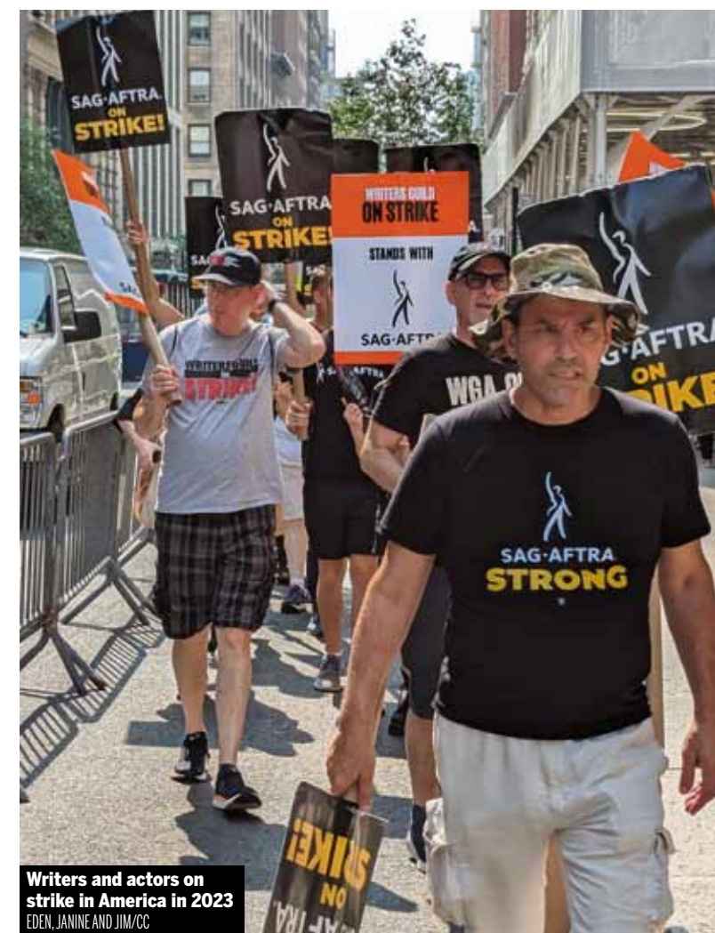
Writers and actors on strike in America in 2023