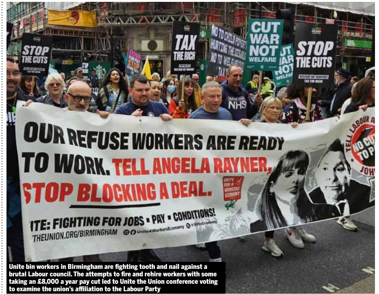
Unite bin workers in Birmingham are fighting tooth and nail against a brutal Labour council. The attempts to fire and rehire workers with some taking an £8,000 a year pay cut led to Unite the Union conference voting to examine the union's affiliation to the Labour Party