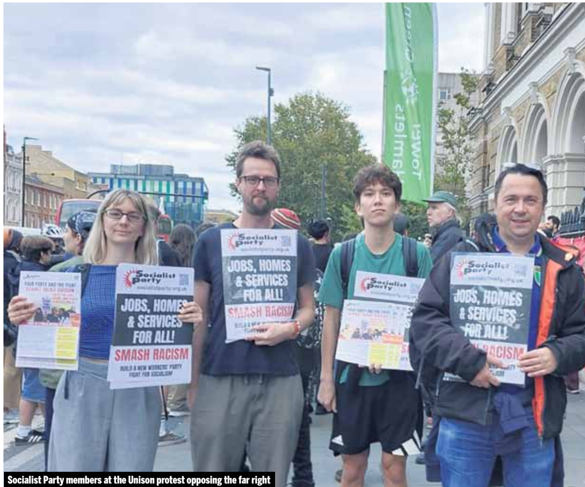
Socialist Party members at the Unison protest opposing the far right