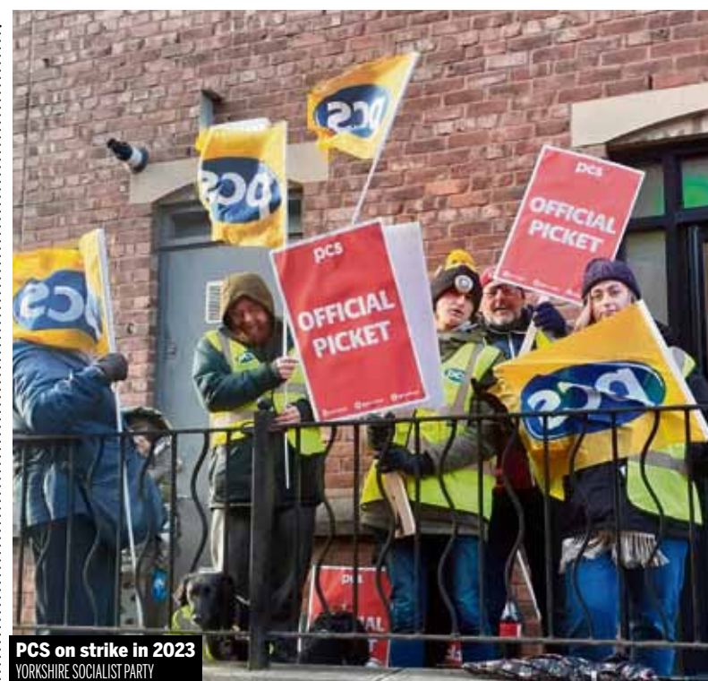
PCS on strike in 2023 YORKSHIRE SOCIALIST PARTY

The Socialist Party calls for a serious, fighting strategy. That means developing a timeline for a ballot in consultation with reps, and giving them the tools they need to breach the Tory anti-trade union 50% turnout threshold – scandalously still in place 15 months into a Labour government.