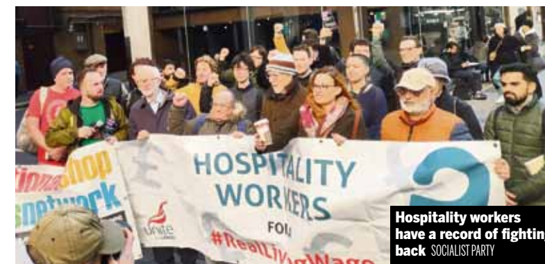
Hospitality workers have a record of fighting back.

Get all the latest union news nationalshop stewardnetwork NSSN bulletin: shopstewards.net