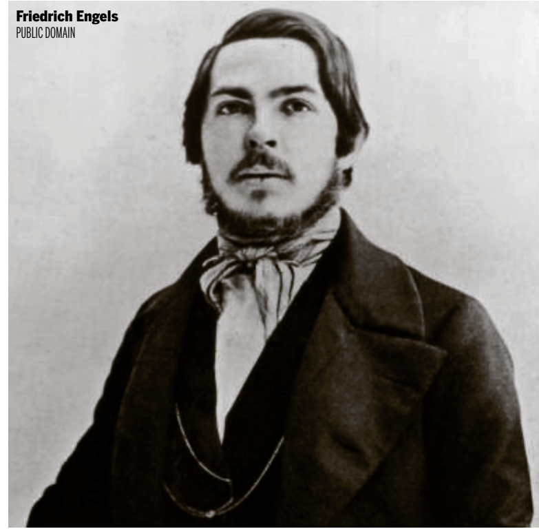
Friedrich Engels

Labour is not a party that represents the needs of the working class, and a new deputy leader isn't going to change that. That is why we need to continue to fight for a new mass workers' party, armed with a socialist programme, that will!