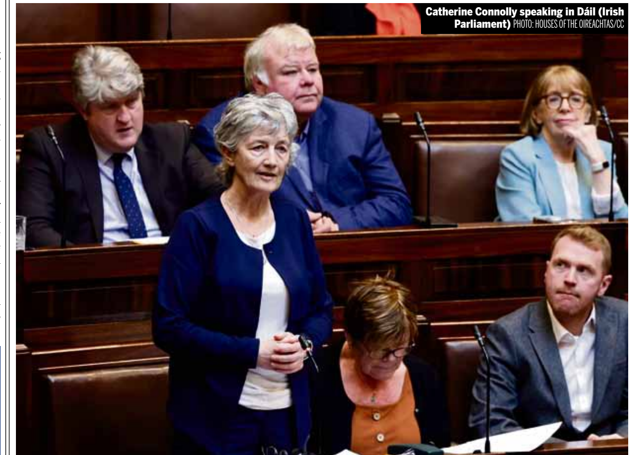
Catherine Connolly has won the 2025 Irish presidential election by a landslide. Her candidacy was supported by left and social democratic parties, the Greens and Sinn Féin.

Connolly secured over 64% of the vote. Her conservative establishment opponent, Heather Humphreys (Fine Gael), received around 28–29%. A third candidate, Jim Gavin (Fianna Fáil), who had withdrawn but too late to be removed from the ballots, received 7%. A record 13% of votes were spoiled. Turnout was at 46.3%.