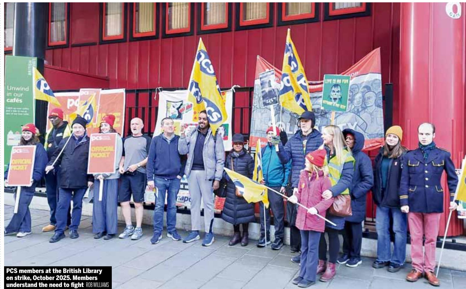
PCS members at the British Library on strike, October 2025. Members understand the need to fight.