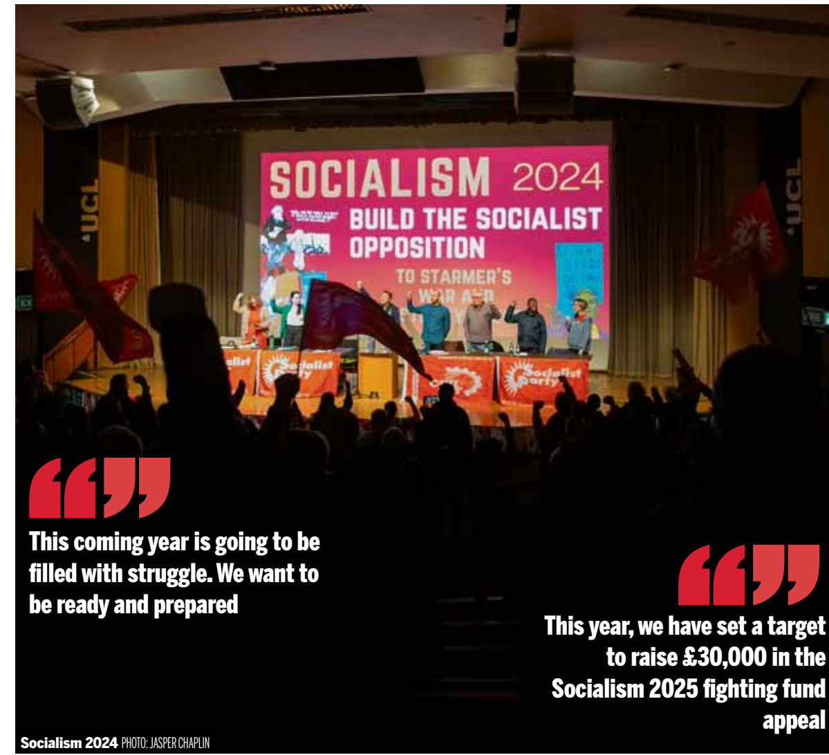
Socialism 2024

This coming year is going to be filled with struggle. We want to be ready and prepared