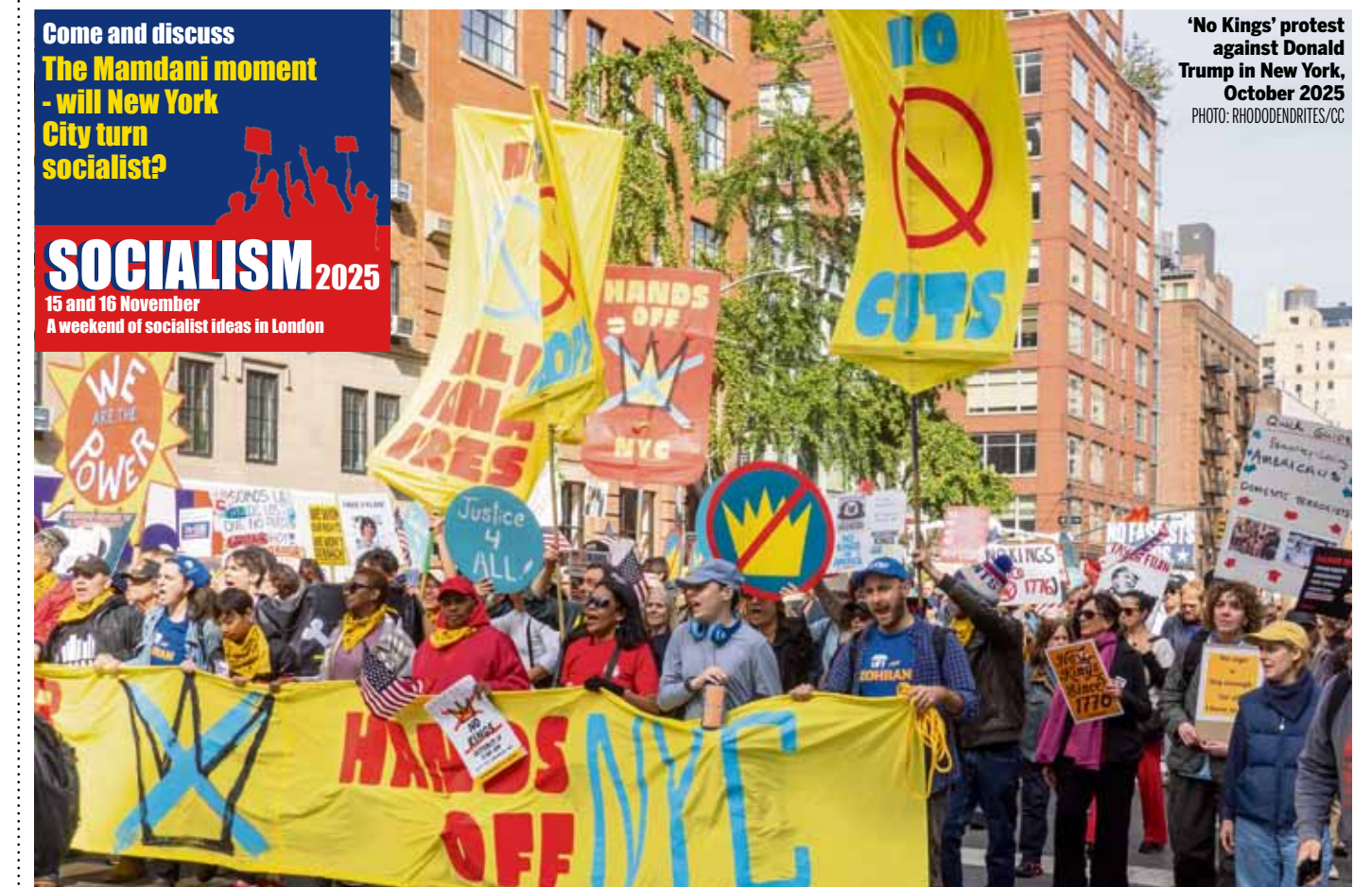
'No Kings' protest against Donald Trump in New York, October 2025

Such a mass workers' party would, if it adopted a socialist programme, raise the idea of an end not just to Wall Street's power in New York but across the US. This means a fight for real socialist change bringing vast resources into public ownership and working-class control.