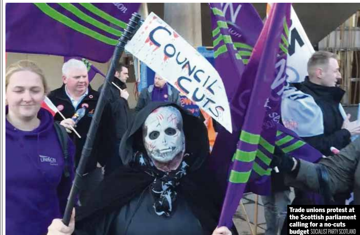
Trade unions protest at the Scottish parliament calling for a no-cuts budget SOCIALIST PARTY SCOTLAND