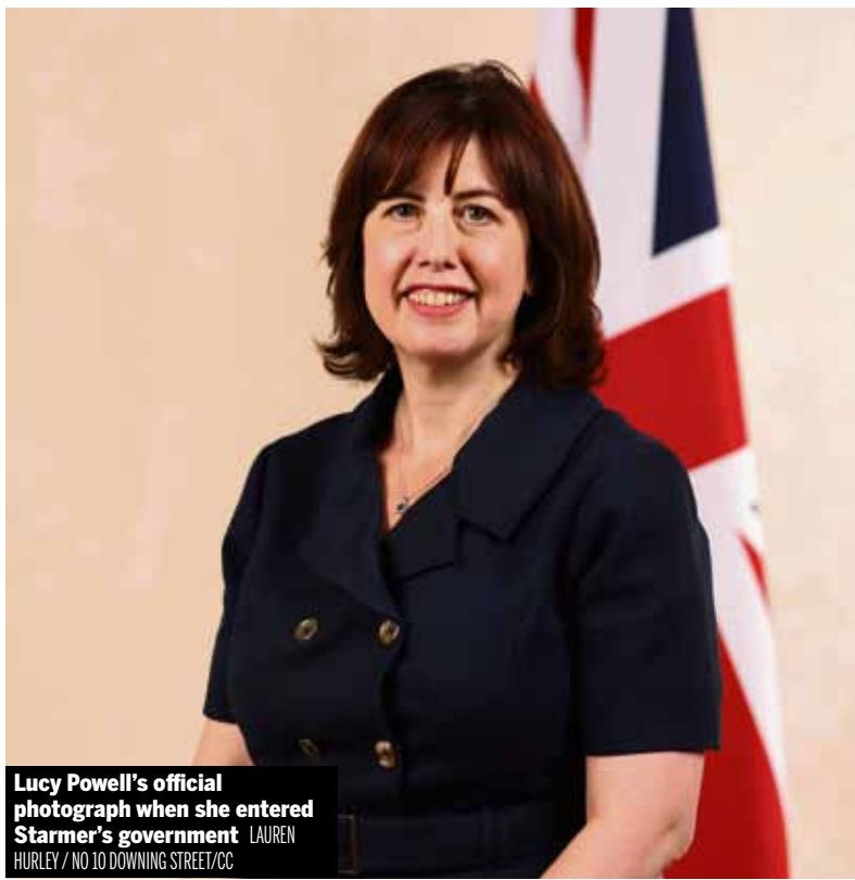
Lucy Powell's official photograph when she entered Starmer's government