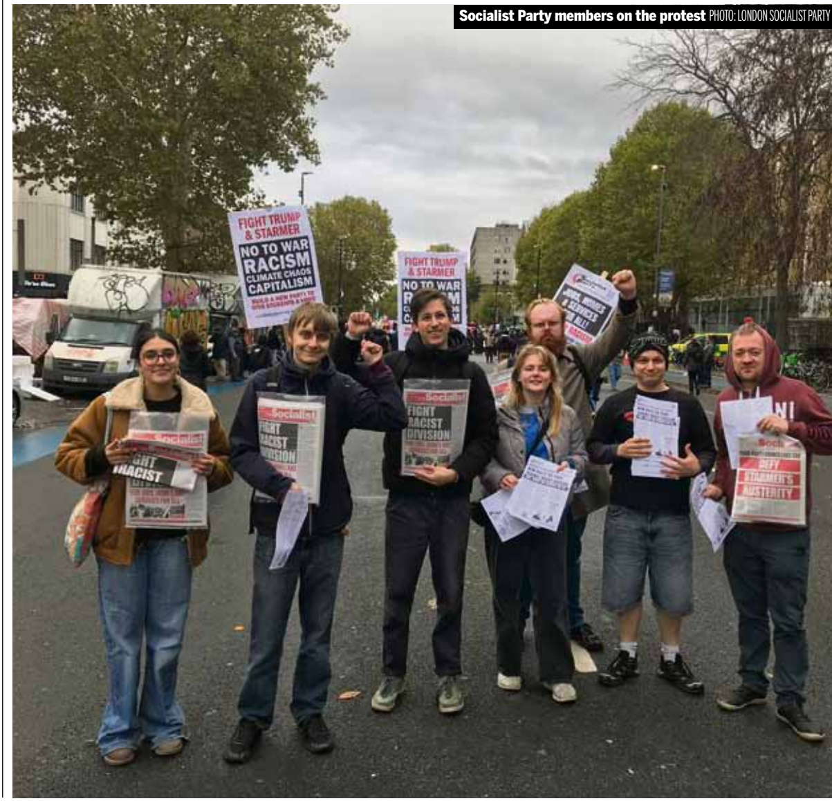
Socialist Party members on the protest

Tower Hamlets Socialist Party will continue working with local trade unionists towards that planned community campaigning against racism and the austerity conditions it breeds in. And with more funding cuts looming, workers' candidates standing against all austerity and for building a fight for the funds Tower Hamlets needs will be essential in May's council elections.