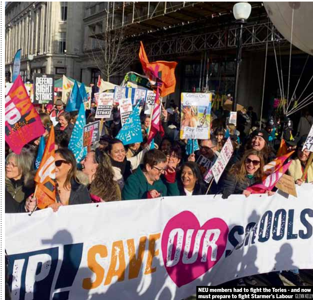
NEU members had to fight the Tories – and now must prepare to fight Starmer's Labour GLENN KELLY

That teachers and lecturers in sixth form colleges have had to fight to receive the same pay uplift as schoolteachers illustrates the need for direct bargaining with the government rather than through the fragmented system of different college CEOs. Any national pay campaign