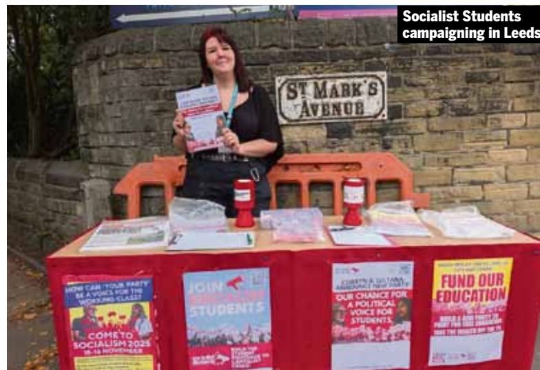
Socialist Students campaigning in Leeds