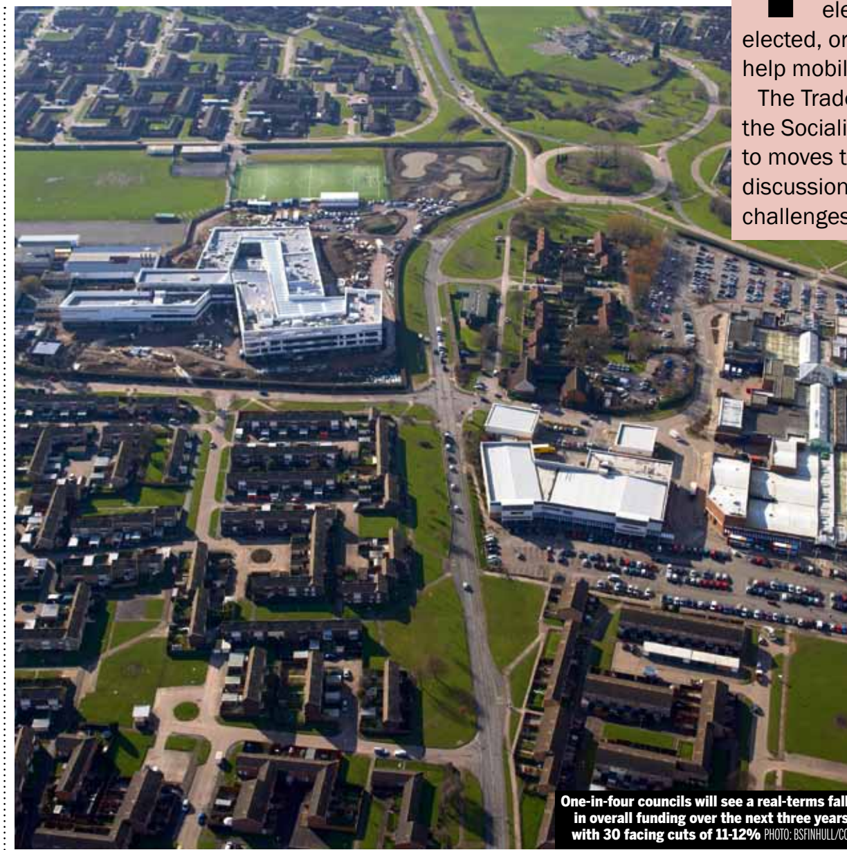
One-in-four councils will see a real-terms fall in overall funding over the next three years with 30 facing cuts of 11-12%.

Some councils, obviously, will gain some additional funding; but one in four will see a real-terms fall in overall funding over the next three years with 30 facing cuts of 11-12%. And although the exact details of how the new funding formulas would apply are still unclear, the biggest losses are set to be inflicted on inner London boroughs and slow population growth areas, such as South Tyneside