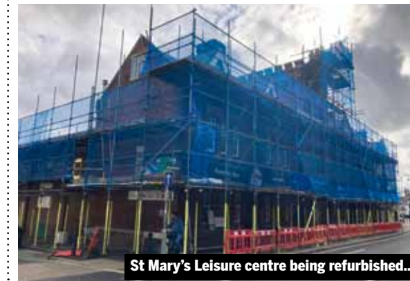
St Mary's Leisure centre being refurbished...