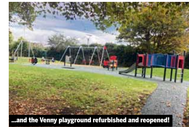
...and the Venny playground refurbished and reopened!

stripped from the council budget. That's why there is a crisis. We demand that money back.