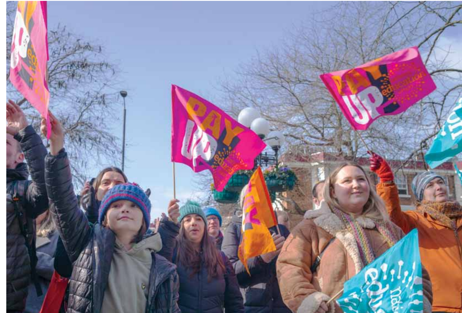
NEU members on strike during the strike wave in 2023 PAUL MATTSSON

the crucial questions of programme requires a democratic and inclusive approach, with no exclusions or prescriptions of socialist parties.