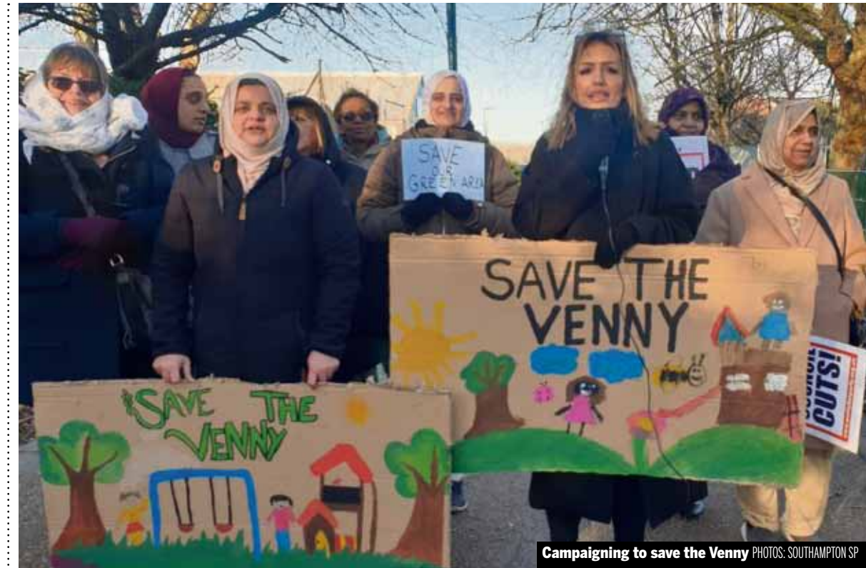
Campaigning to save the Venny

When we elect fighting anti-cuts councillors who will refuse to carry out cuts and fight for the restoration of government funding cut since 2010. Over £500 million has been