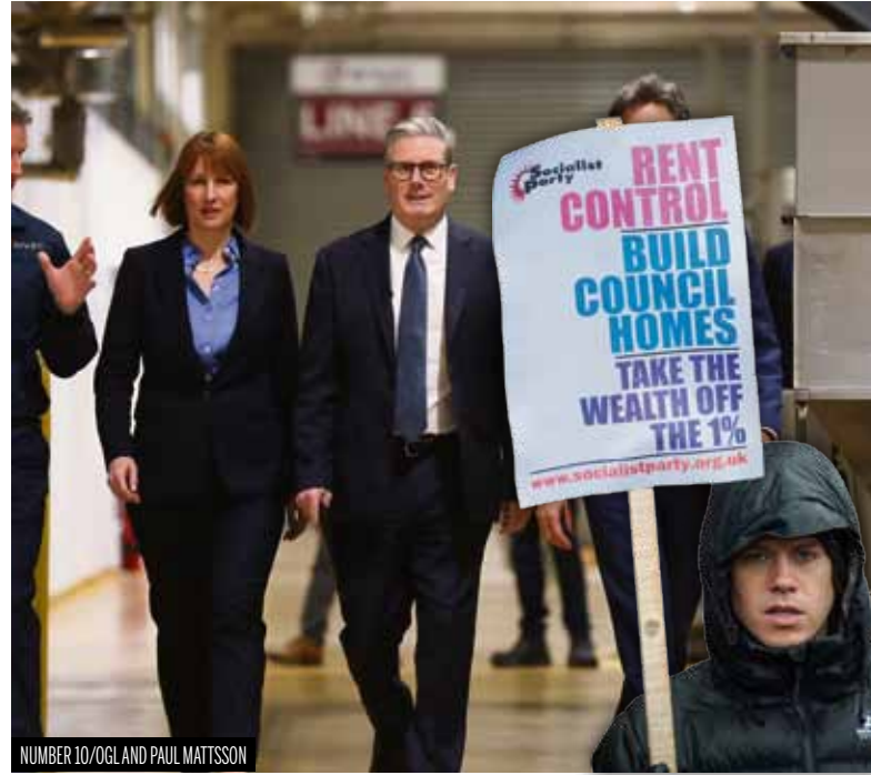
NUMBER 10/OGLAND PAUL MATTSOON

The upcoming May council elections offer an opportunity for potential Your Party candidates to propose