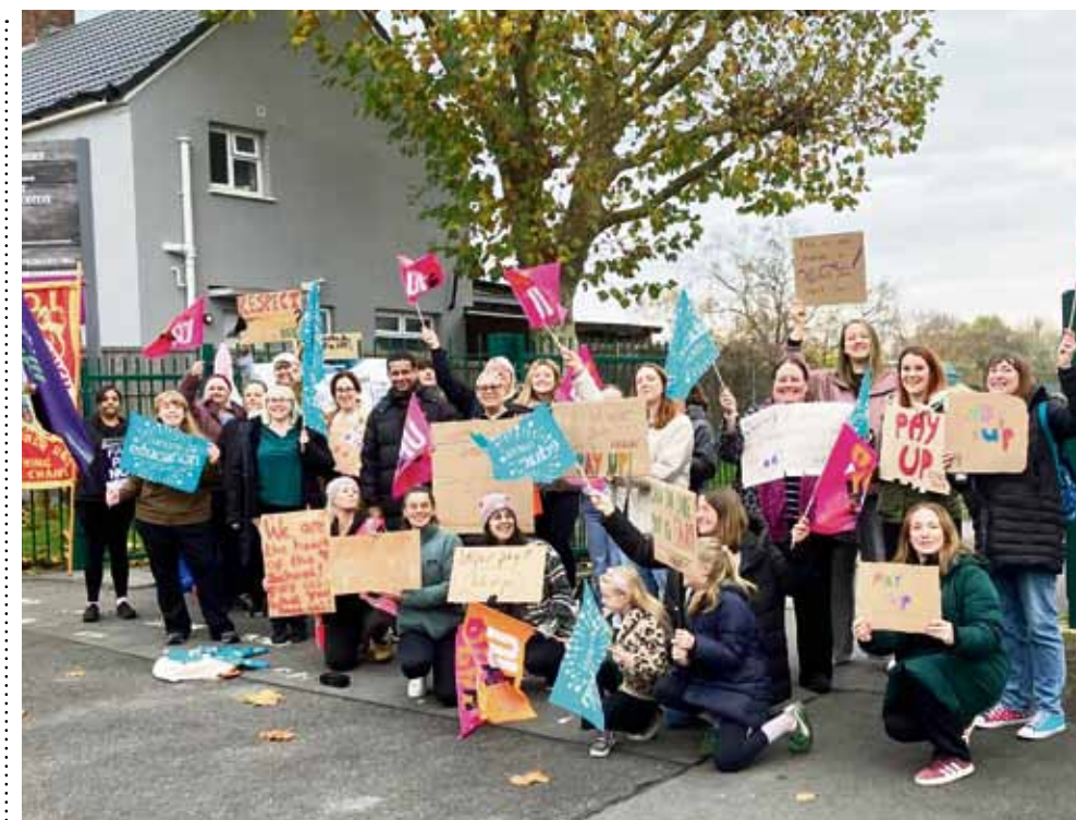
There were big picket lines at all 12 schools in the trust