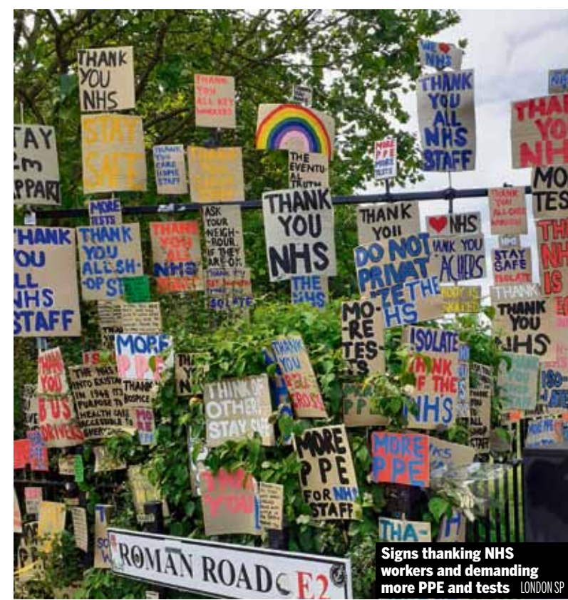
Signs thanking NHS workers and demanding more PPE and tests LONDON/SP