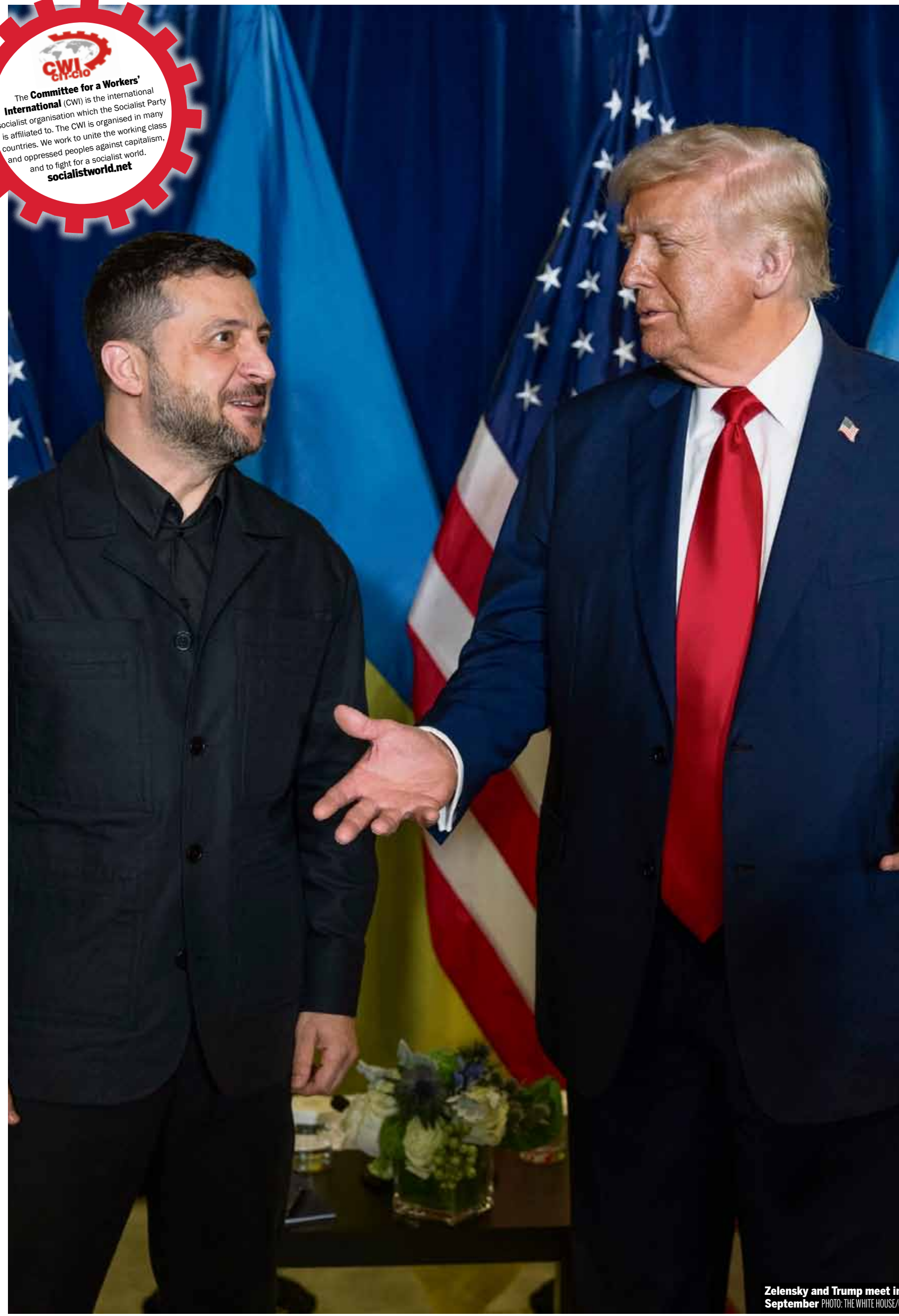
Zelensky and Trump meet in September

Most European states face weak growth, high debt levels and high interest rates, and are unwilling to take on new economic burdens, despite their tough talk about fighting Putin to the end.