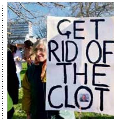
Above: The CEO is not popular Right: Strikers speak SOCIALIST PARTY

He told the BBC that "this is taxpayers' money." Yet it has been