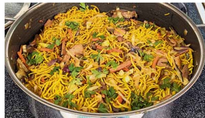
It's getting ever more expensive for families to make nutritious home-cooked meals for the kids

Food insecurity is a product of capitalist greed. We need to take the food production and distribution out of the hands of agribusiness and the capitalist elite, and put it under the control of workers alongside small farmers and consumers. Only by replacing the capitalist system with socialism, in which workers plan production democratically based on a nationalised economy, can we end food insecurity for all.