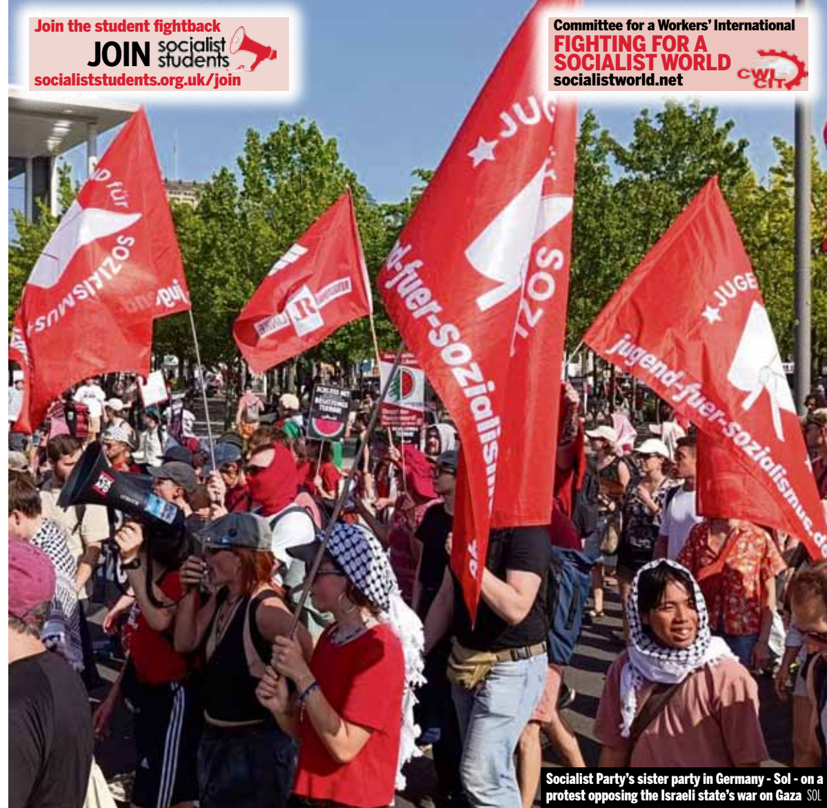
Socialist Party's sister party in Germany - Sol - on a protest opposing the Israeli state's war on Gaza SOL