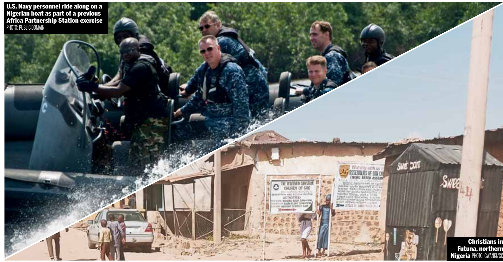
U.S. Navy personnel ride along on a Nigerian boat as part of a previous Africa Partnership Station exercise