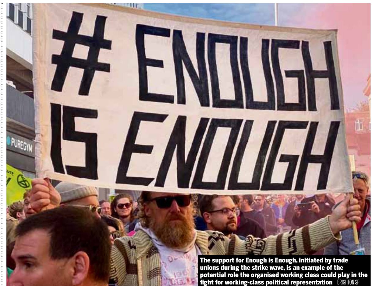
The support for Enough is Enough, initiated by trade unions during the strike wave, is an example of the potential role the organised working class could play in the fight for working-class political representation BRIGHTON/SP

There is a glaring contradiction, between the policies of Labour in government and the demands of most trade unions. At this stage, the majority of trade union leaders either defend their link to Labour, arguing that at least they get a seat at the table, using the threat of Reform to argue for continued support for Labour. Alternatively, facing the