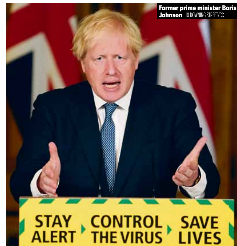
Former prime minister Boris Johnson

The Covid pandemic revealed the plain truth about society: it's the workers who keep society running. Supermarket staff, nurses, bin workers and many more. The government hailed us as key workers, then told us we didn't deserve a pay rise. But this experience led to the 2022-23 strike wave, which was just a small taste of our potential collective power as the working class in action. It also revealed another truth: you can't control what you don't own. We can't rely on the bosses' politicians to work for us, we need a mass party of the working class! More than five years after the start of the pandemic, the Socialist Party is playing a critical role in the fight to build such a party. If you agree, join us!