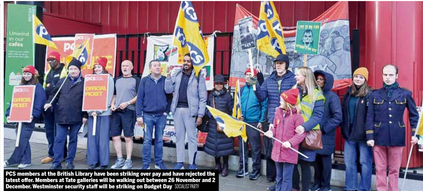
PCS members at the British Library have been striking over pay and have rejected the latest offer. Members at Tate galleries will be walking out between 26 November and 2 December. Westminster security staff will be striking on Budget Day

We involved tens of thousands of members in a political debate to create the 'PCS Alternative', on