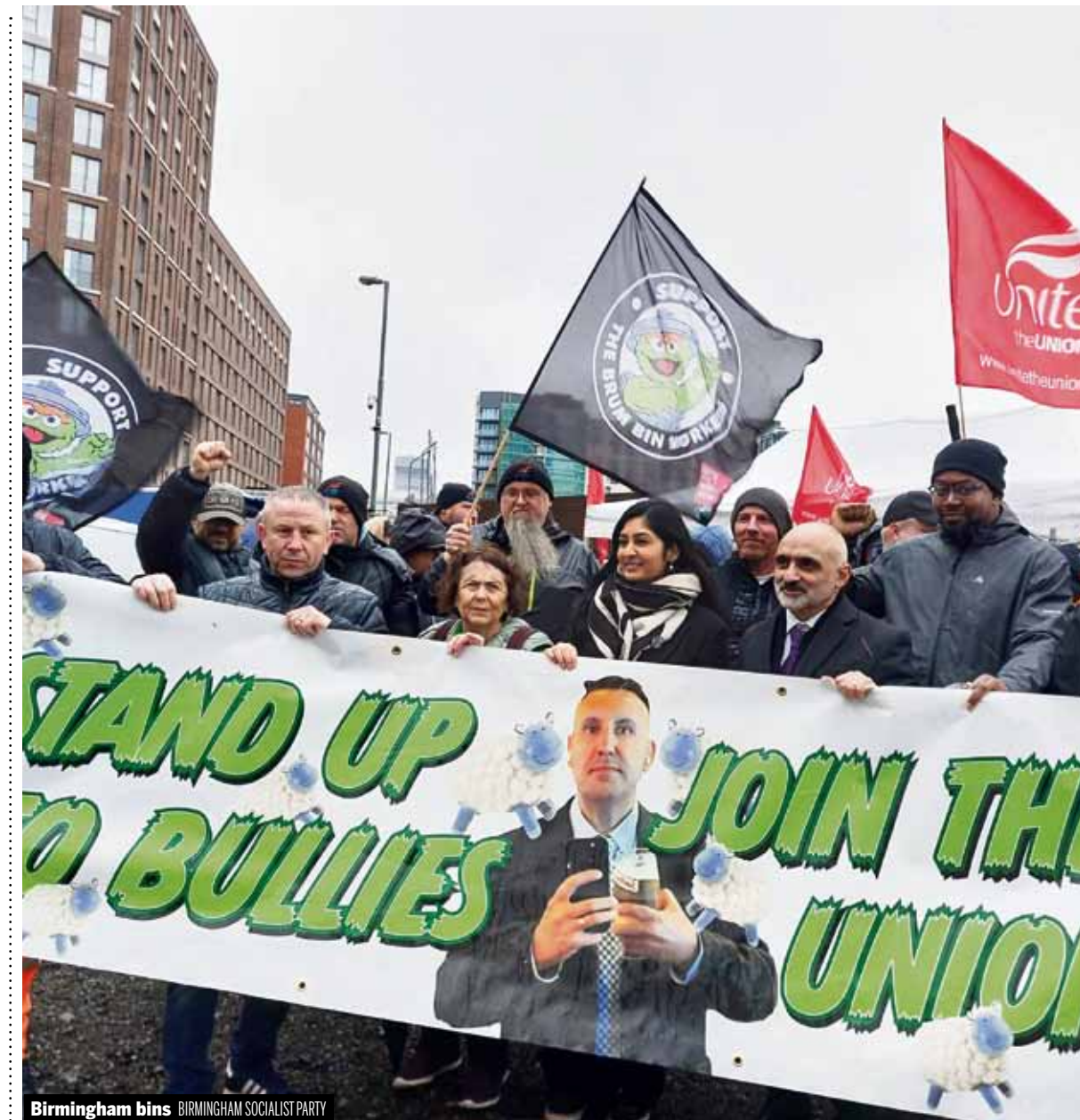
Birmingham bins BIRMINGHAM SOCIALIST PARTY

The shift to the right by UL was graphically shown during the 2021 election, when UL candidate Steve Turner criticised the union's