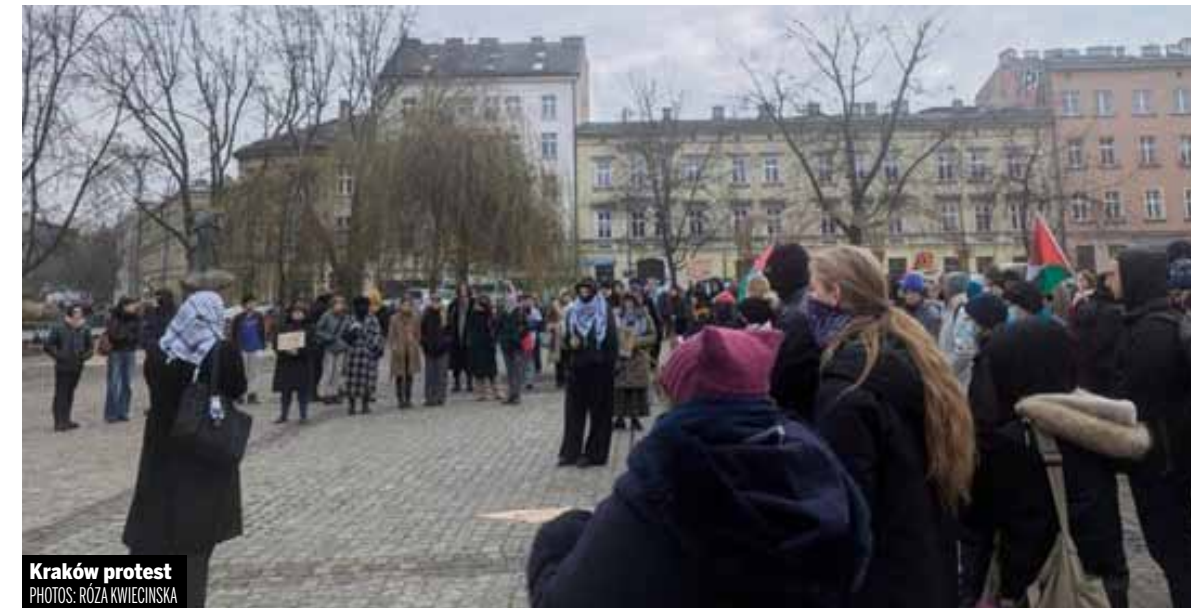
Kraków protest