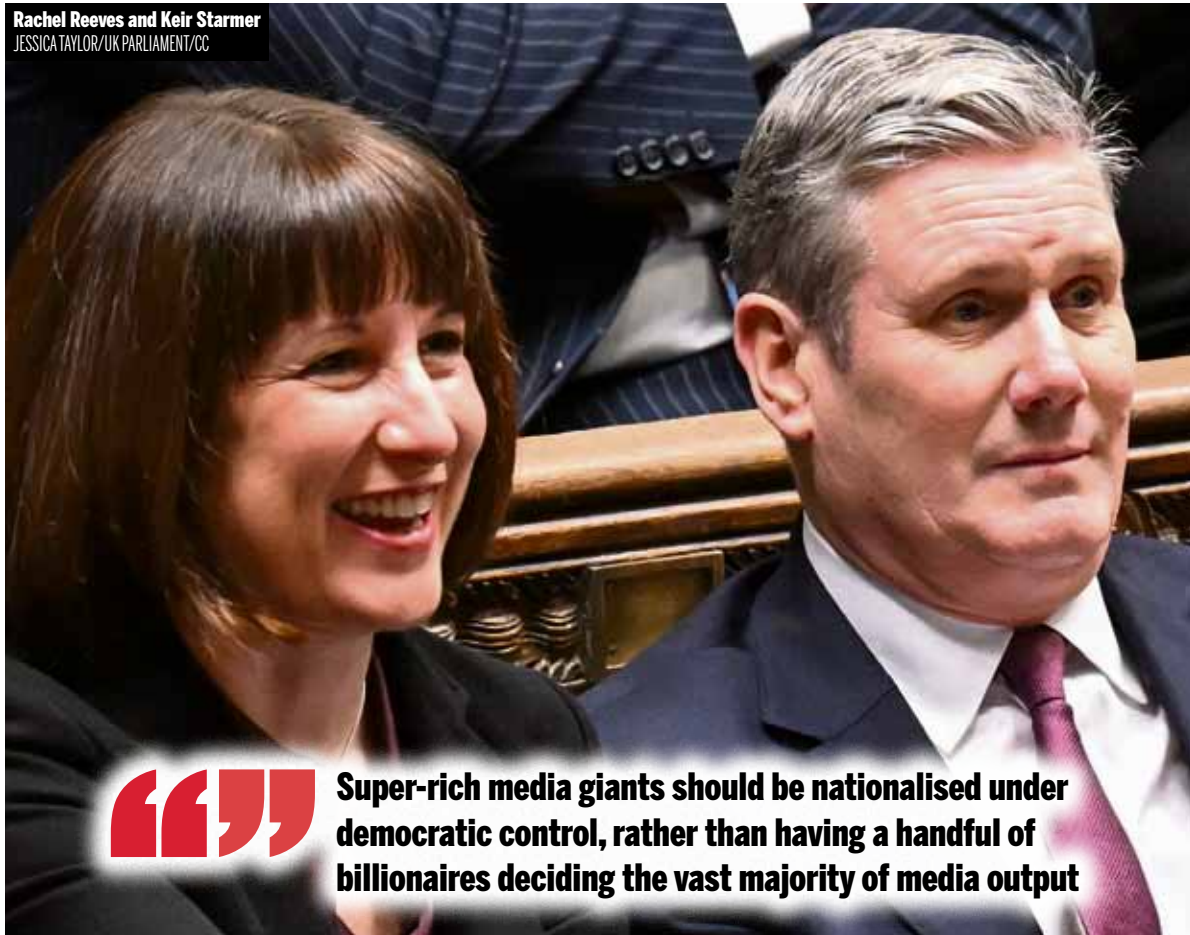
Rachel Reeves and Keir Starmer

Join the student fightback JOIN socialiststudents.org.uk/join