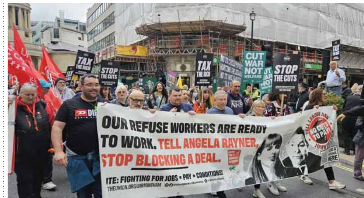
Top: Birmingham bin strikers marching against Labour Below: TUSC campaign in Doncaster in May 2025