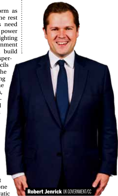
Robert Jenrick

say. To oppose the bosses, their divisive ideas and to take the wealth and power back into our hands, we need to get organised. Discussions within trade unions on the necessary steps for our class to establish our own political voice are ongoing. To get involved in that fight, and to put to bed a system which puts profit over the interests of the vast majority of us, join the Socialist Party today.