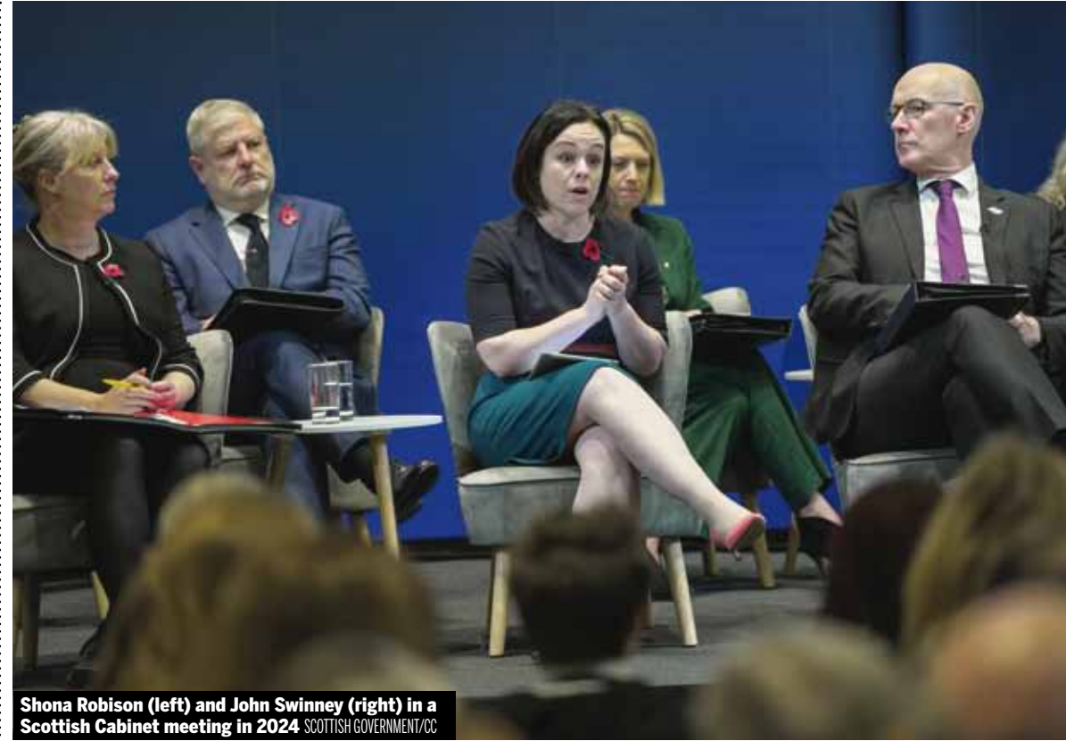
Shona Robison (left) and John Swinney (right) in a Scottish Cabinet meeting in 2024.

The demand for further cuts to budgets at local government level in February-March must be resisted by councillors with a fighting no-cuts policy.