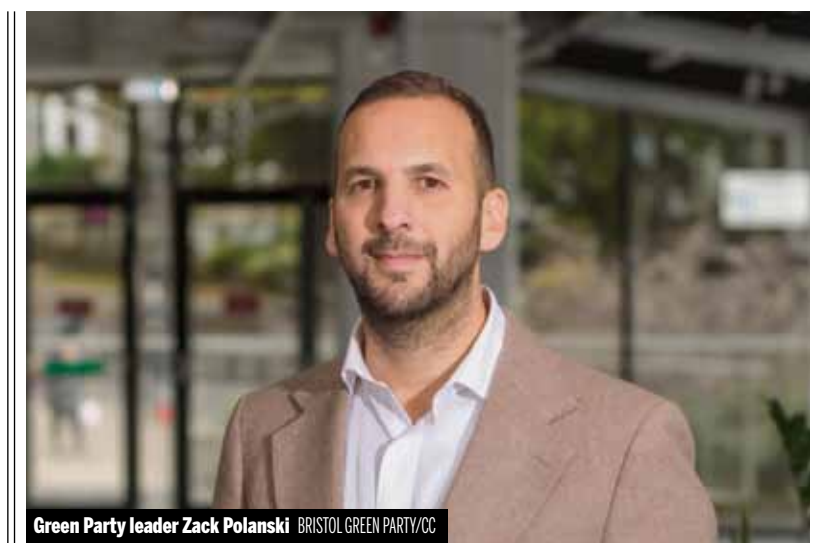
Green Party leader Zack Polanski

And together with local trade unions, be prepared to mobilise people to fight for that money to come from central government, not stolen from other local authorities.