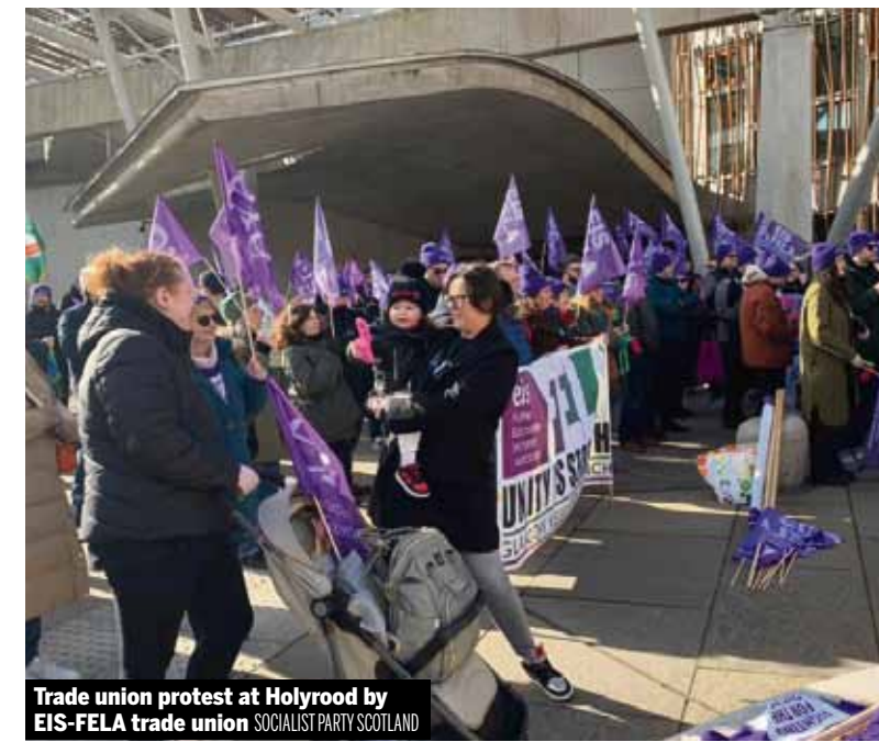
Trade union protest at Holyrood by EIS-FELA trade union

"Social care staff will continue to be paid pennies above the minimum wage despite doing skilled, demanding and emotionally tough work. This lets down those receiving care and does nothing to improve recruitment in a sector on its knees."