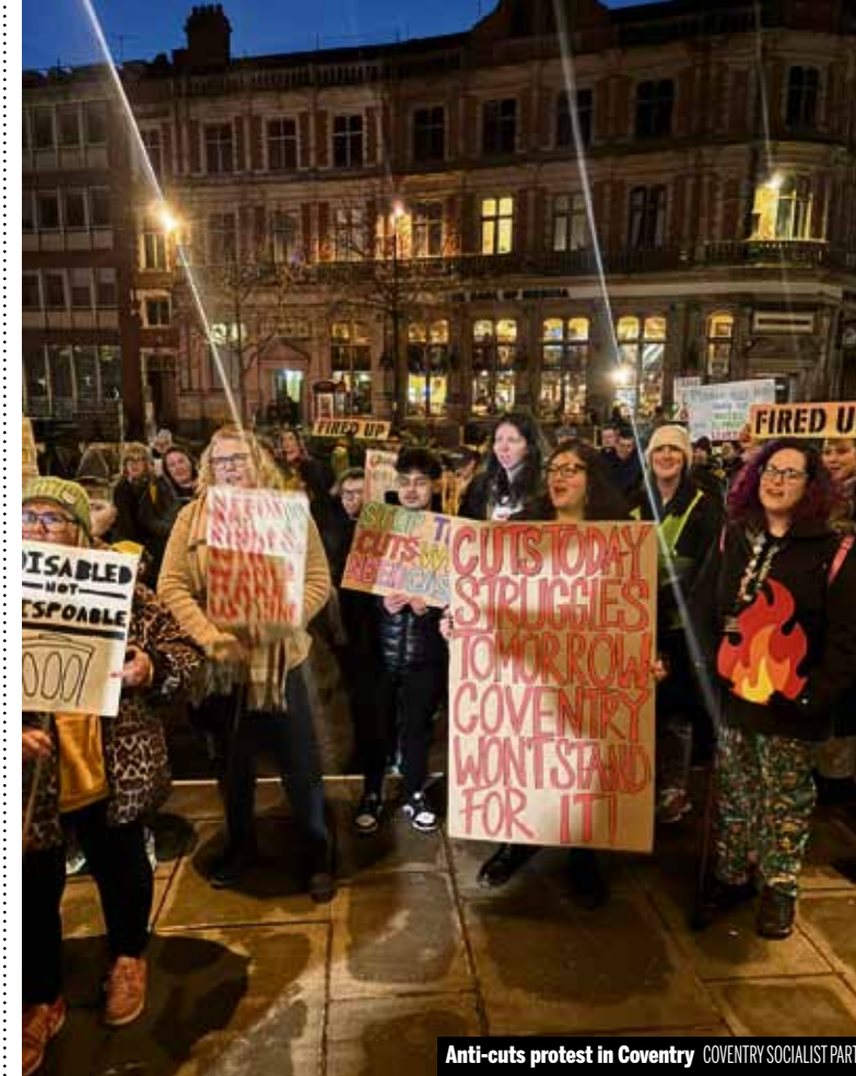
Anti-cuts protest in Coventry COVENTRY SOCIALIST PARTY

The conference also discussed how the council chamber can be a vital voice for other causes. When