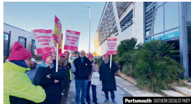
Portsmouth SOUTHERN SOCIALIST PARTY

I spoke to one of the pickets who pointed out some of the problems