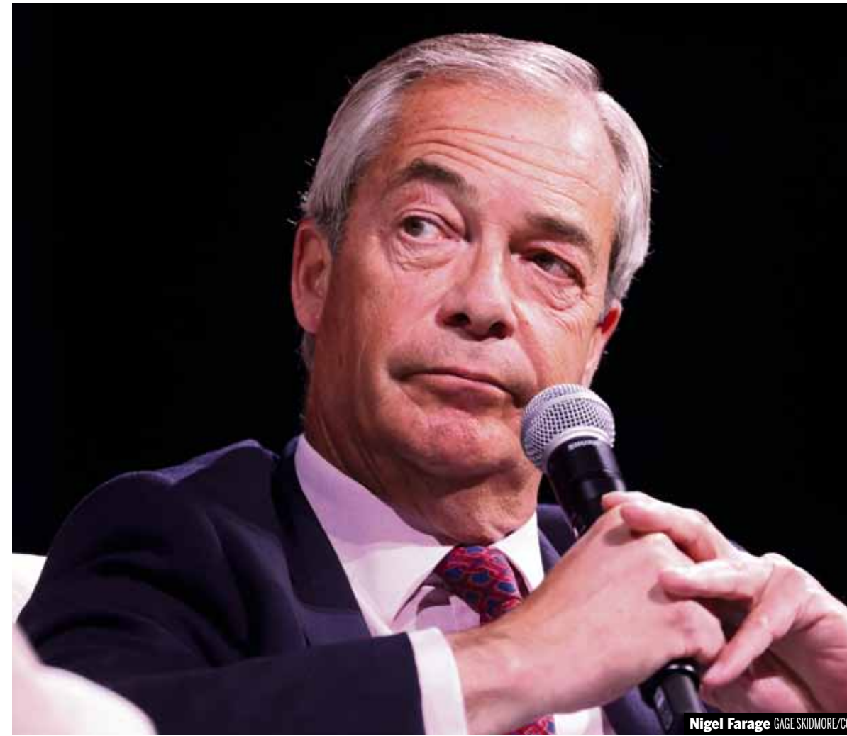
Nigel Farage

Socialist Party Scotland calls on Your Party (YP) to mount as wide a socialist challenge as possible for Holyrood. The Scottish YP conference on 7-8 February is a vital step in that preparation, and we'll be attending to help argue for such an election stand.