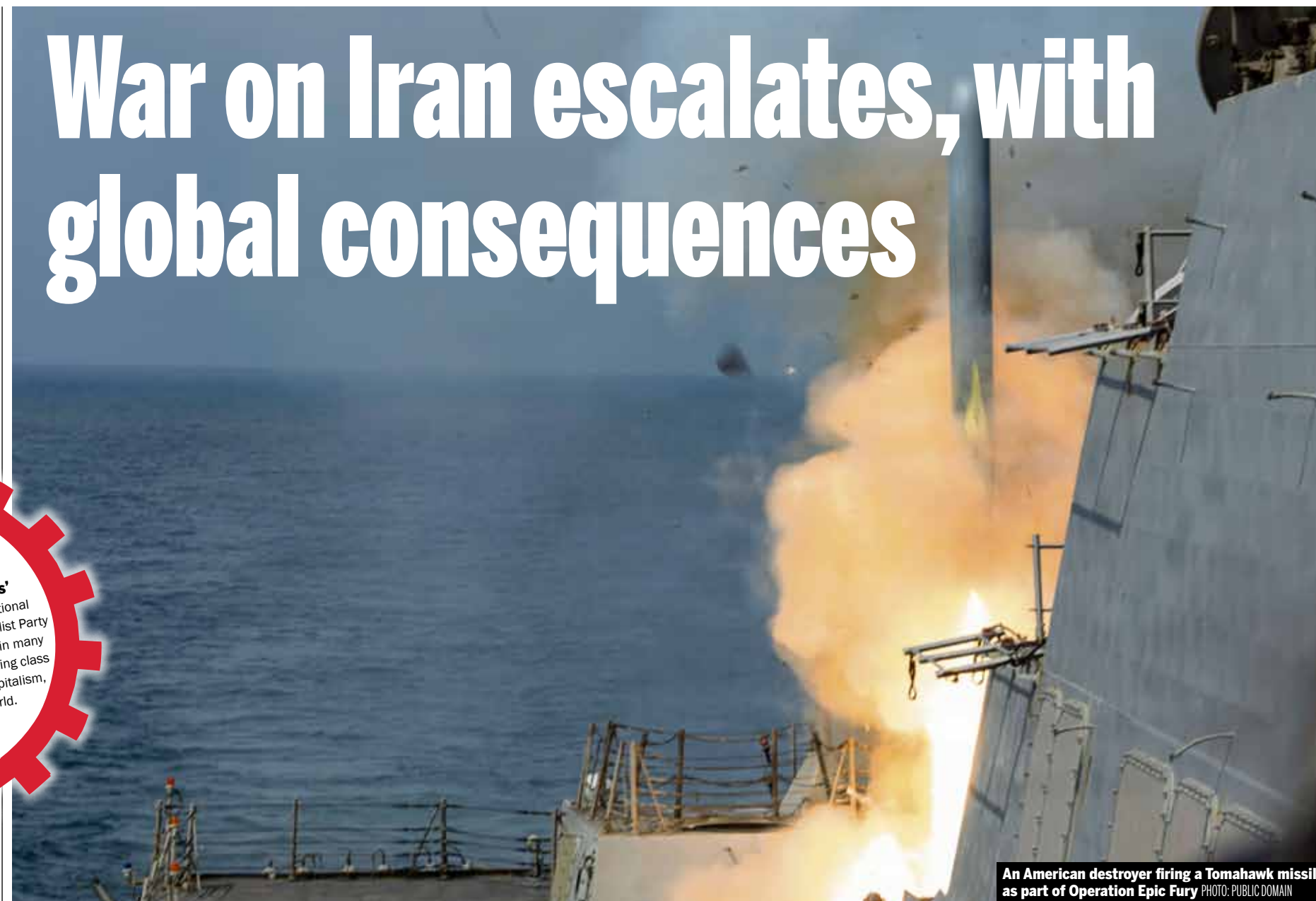
An American destroyer firing a Tomahawk missile as part of Operation Epic Fury