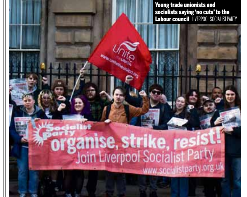
Young trade unionists and socialists saying 'no cuts' to the Labour council. LIVERPOOL SOCIALIST PARTY

Join the student fightback JOIN socialist students socialiststudents.org.uk/join