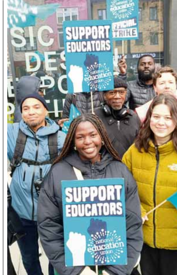
Above: Access Creative College Below: Brick Lane School