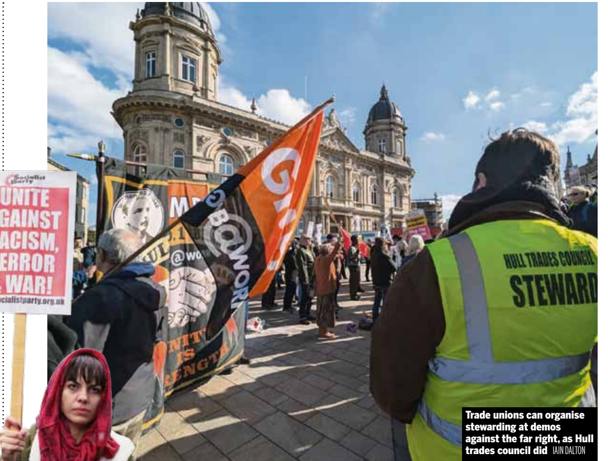
Trade unions can organise stewarding at demos against the far right, as Hull trades council did

Like the Tories, the Labour government has shown that minority rights are not secure in a society in which a capitalist elite relies on scapegoating