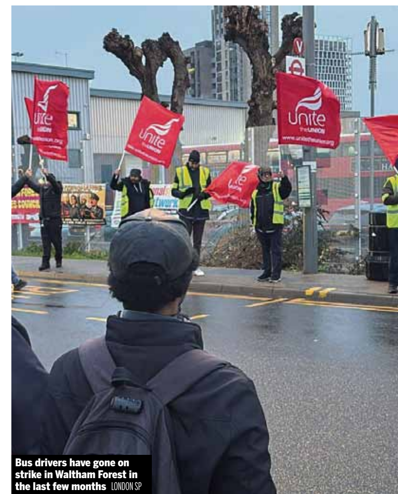
Bus drivers have gone on strike in Waltham Forest in the last few months LONDON SP