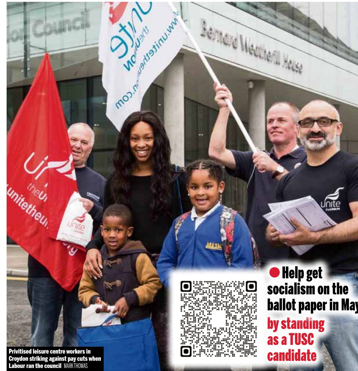
Privatised leisure centre workers in Croydon striking against pay cuts when Labour ran the council.