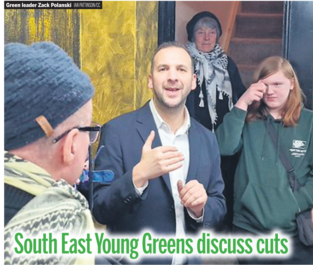
Green leader Zack Polanski