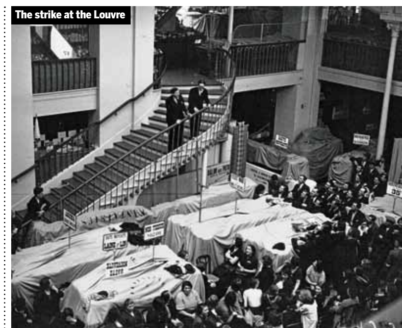
The strike at the Louvre

"The fascists find their human material mainly in the petty bourgeoisie [middle class layers]. The latter has been entirely ruined by big capital... Fascism is the act of placing the petty bourgeoisie