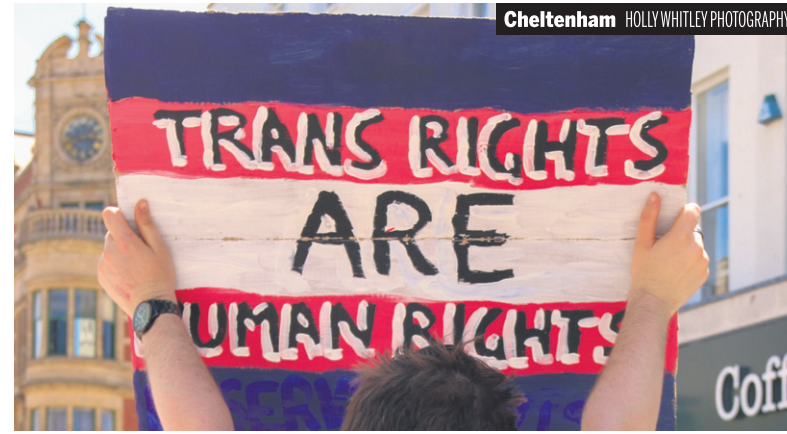
Cheltenham HOLLY WHITLEY PHOTOGRAPHY