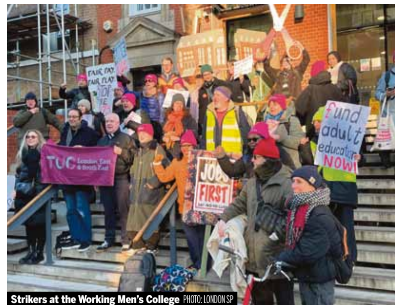
Strikers at the Working Men's College