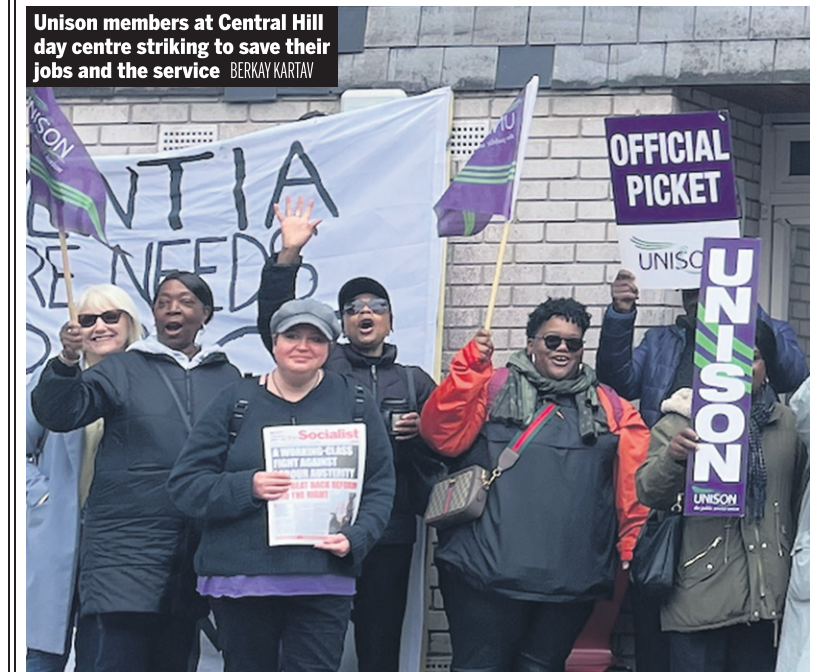
Union members at Central Hill day centre striking to save their jobs and the service

Taking such a stand, meeting with the trade union movement locally, would mark a chance for Green councillors to build a campaign to win back the funding stolen from Lambeth by Tory and Labour governments since 2010.