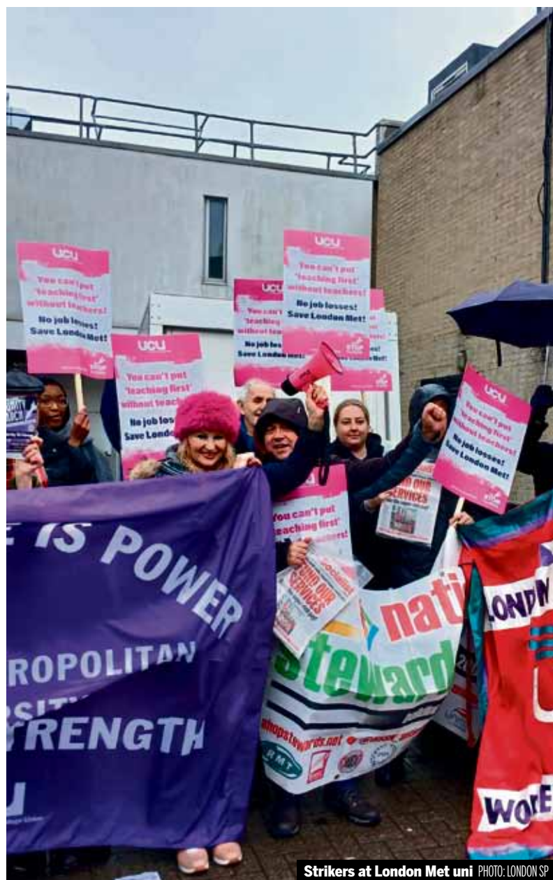
Strikers at London Met uni

SCOTT HUNTER SWINDON COLLEGE UCU, PERSONAL CAPACITY