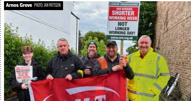
Arnos Grove